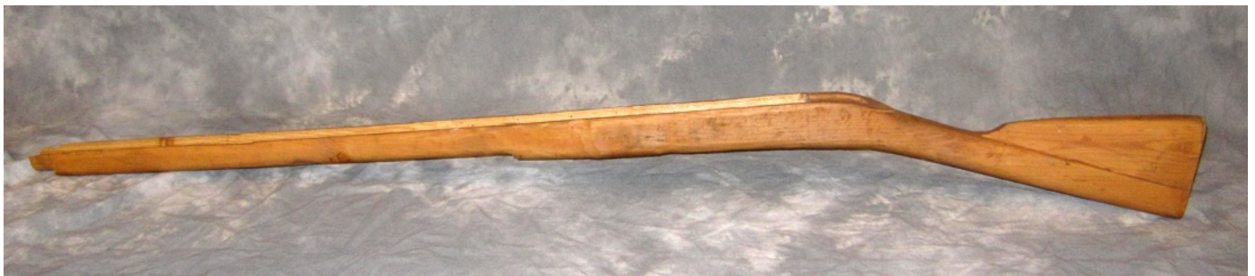
Sample of rifle stock replica.

If you are interested in helping with canteens, contact Dorsey at (630) 495-1821.