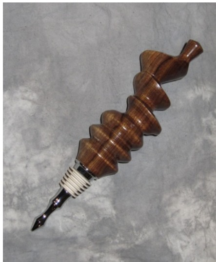
Multi-axis bottle stopper

he makes a multi-axis bottle stopper using a 4 jaw scroll chuck and only three turning tools; a 3/8 spindle gouge, a roughing gouge and a skew. The bottle stopper is usually