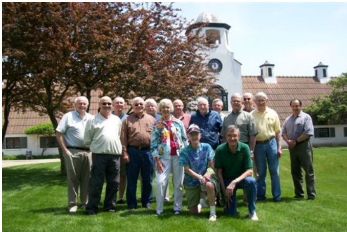
Members at the May 22nd Crab Tree Farms tour.

On, Wednesday, August 18, we have scheduled a tour of Baker Road Furniture in South Elgin, Illinois. The tour will begin at