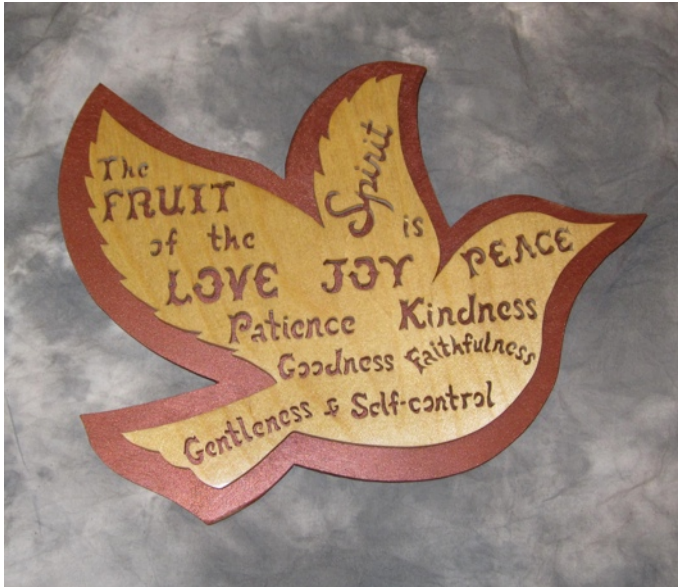
Cathy Godfrey, Dove Plaque