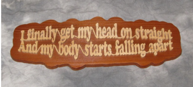
Ken Webster, Scrollsaw Plaque