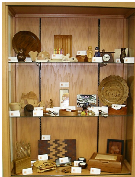
Homer Glen display