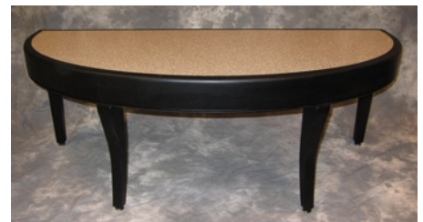
Fred Rizza, Cocktail Table