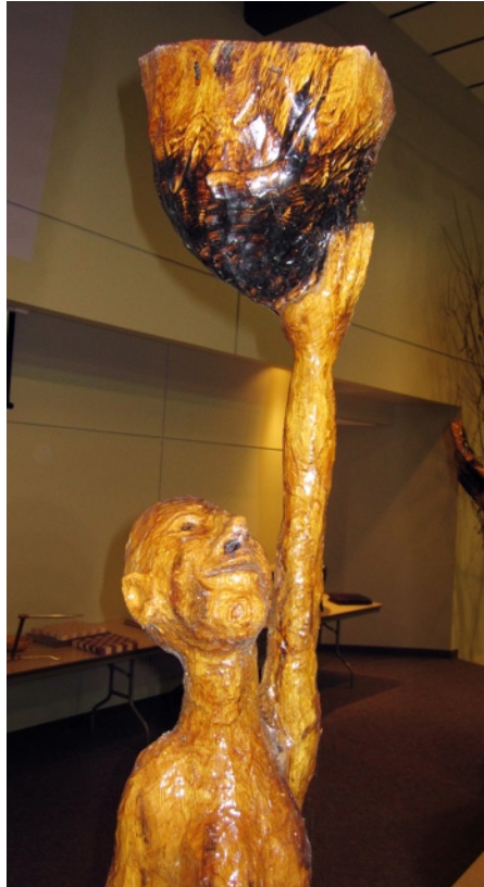
Detail of an Andry Framton chainsaw carving

For finer cuts he uses a grinder with a saber tooth blade, an Arbortech carbide cutter and Dremel with various bits and blades. Color is added with a propane torch. Finish is 5-6 coats of water based polyurethane brushed on.