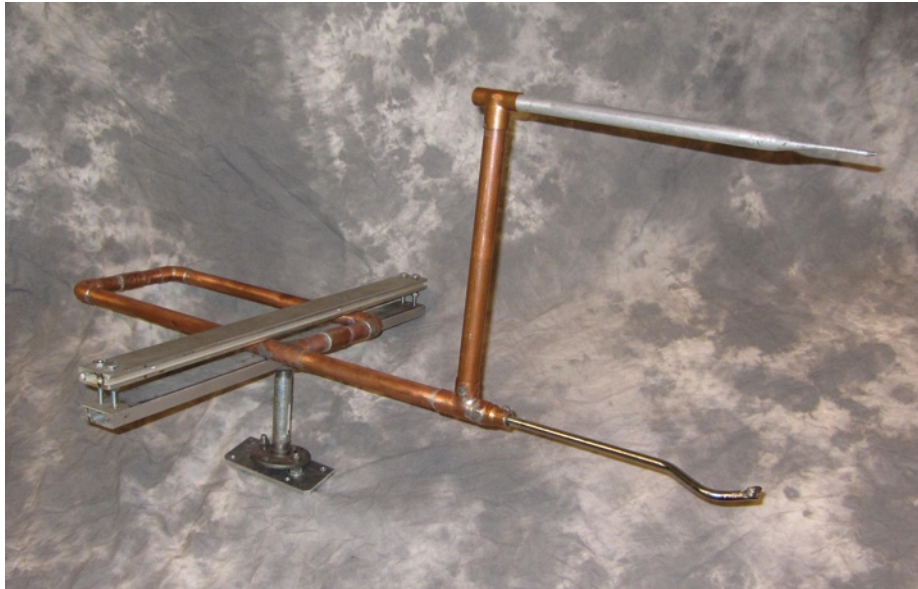
Bert LeLoup, Bowl Hollowing Jig for Turning

From Our Workshop, September 2010 continued