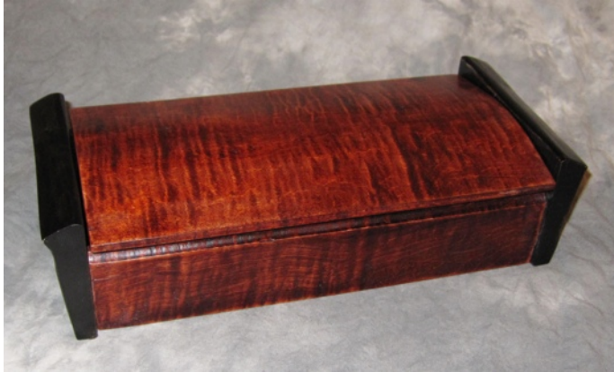
Bert LeLoup, Curly Maple Box