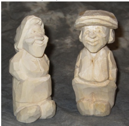
Jim Arenot, Little Folk Flat Plane Carving