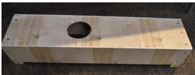
Bert Le Loup end grain cutting board & a vac- cum hood for drum sander