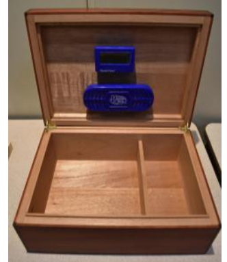
Ken Everett Humidor