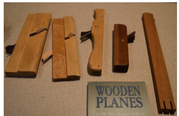
Dave Reilly Hollow & Round planes