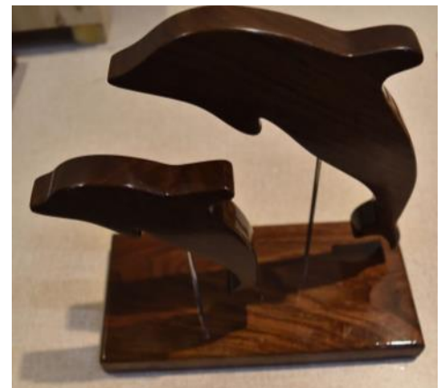
ED Buhot Dolphins playing