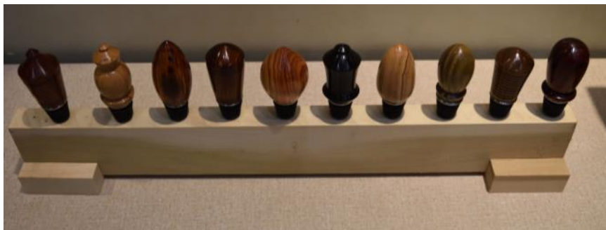
Len Swanson Bottle Stoppers