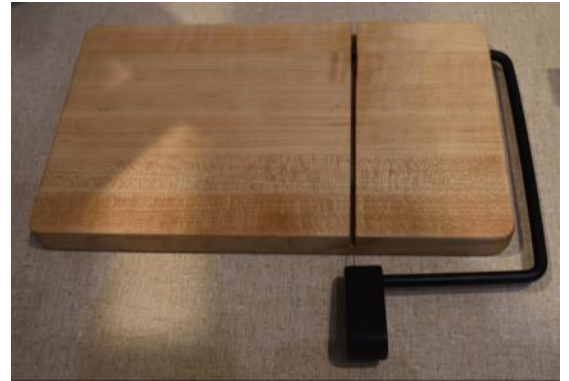
Dave Brearley Cheese cutting board