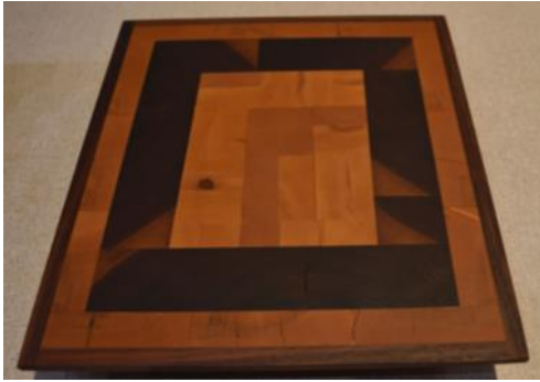
Rich Orgen Cutting board