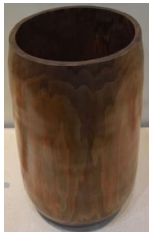
Rich Rossio Walnut Vase