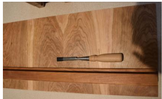
Bill Schwartz Chisel rack parts