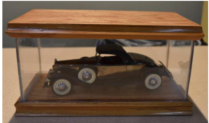
Tim McAuley Model car case