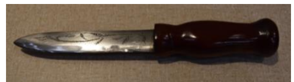
Bert Le Loup Knife from old file