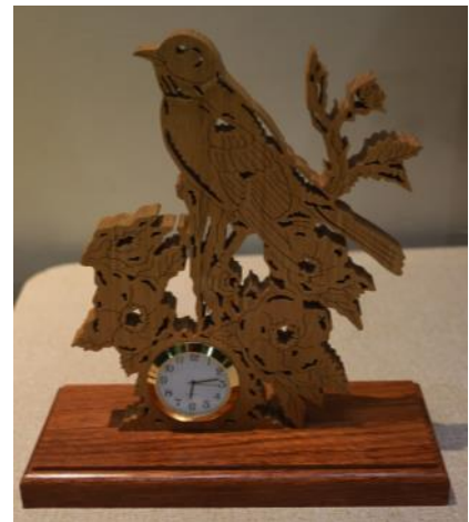
Roy Galbreath Clock