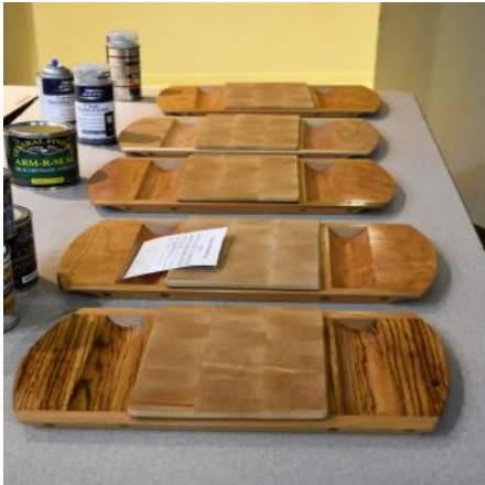
Dave Brearley Cheese cracker boards