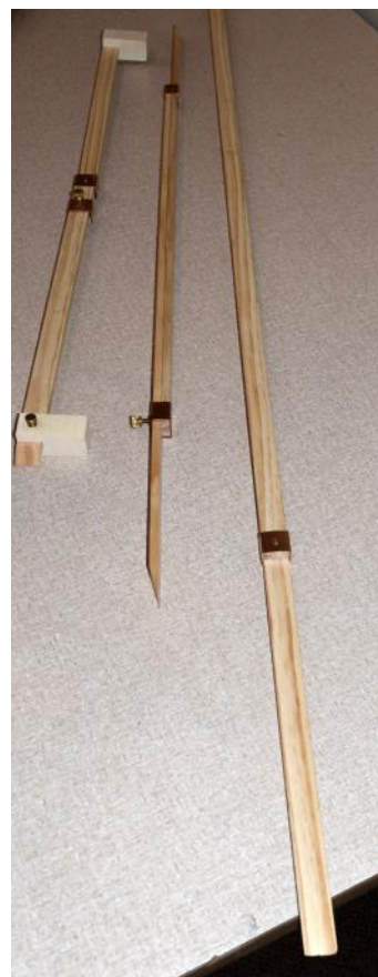
Bill Schwartz measuring sticks