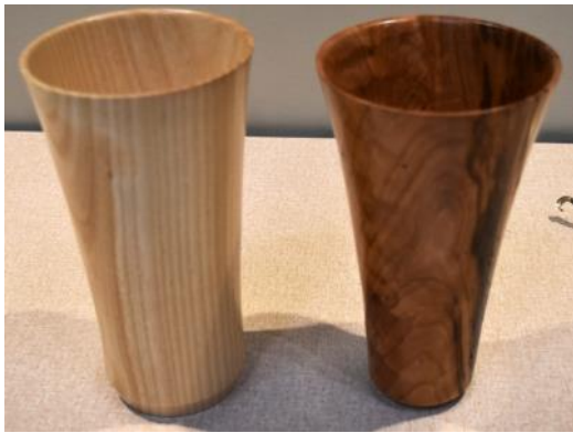
Jack Harkins Vase