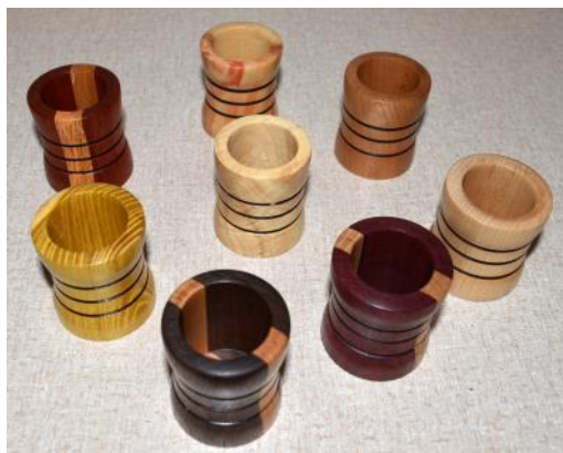
Don Hoffman Tooth pick holders