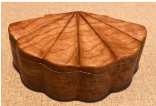
Lee Nye Scalloped Band Saw Box