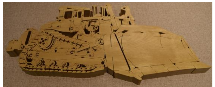
Roy Galbreath Bulldozer