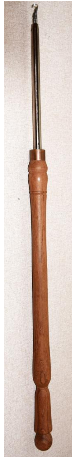
Jack Harkins Hook tool