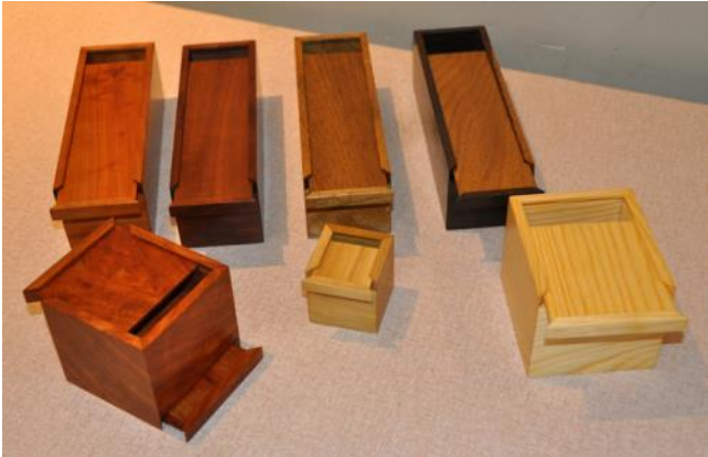
Jim Harvey - Sliding Lid Boxes Various, Fumed Oak - Watco, Paste Wax