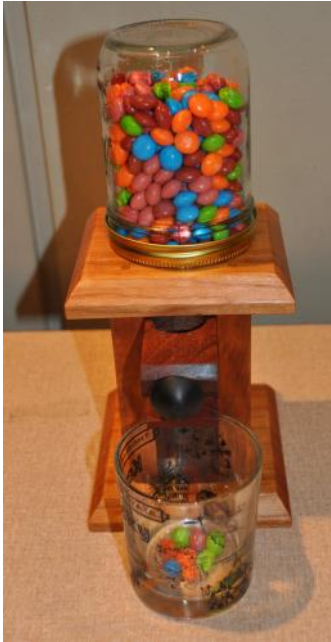
Don Burgeson - Candy Dispenser Various, Fumed Oak - Oil