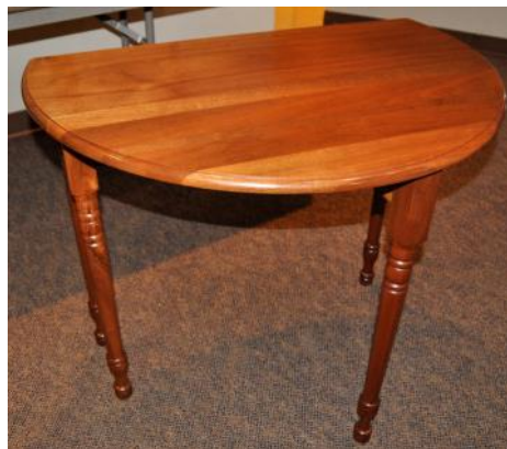
Rick Ogren - Gate Leg Table Walnut - Poly Mini Wax