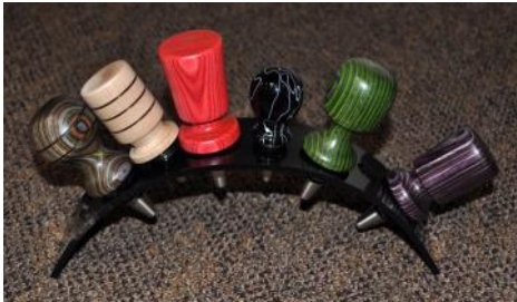
Al Cheeks - Bottle Stoppers