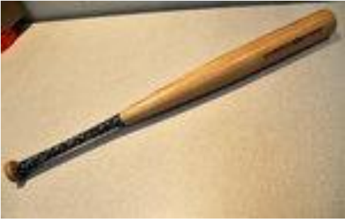
Tony Leto - Bat Ash - Poly Mini Wax