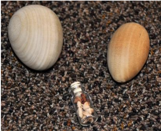
Dave Reilly - 2 Eggs, 1 bottle full of tops