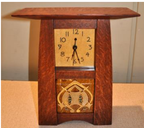
Wayne Maier - Arts & Craft Clock White Oak - Lacquer