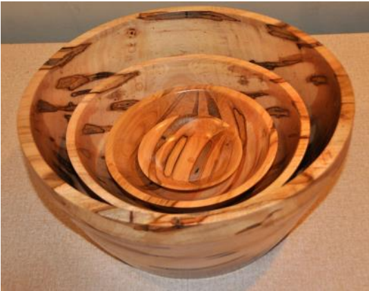
Rich Rossio - Stack Bowls Ambrosia Maple - Watco, Paste Wax