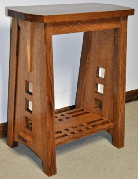
Lee Nye - Arts & Craft End Table QS White Oak - Minwax Walnut Stain / Poly