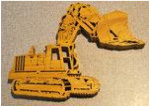
Roy Galbreath - Scroll Saw Hedge - Spray Poly