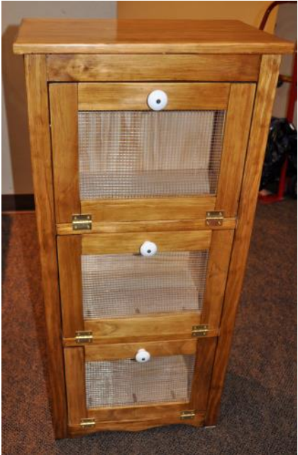
Paul Kricensky - Kitchen Cabinet Pine - None