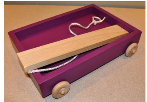
Len Swanson - Christmas Toy Wagon Pine - Milk Paint