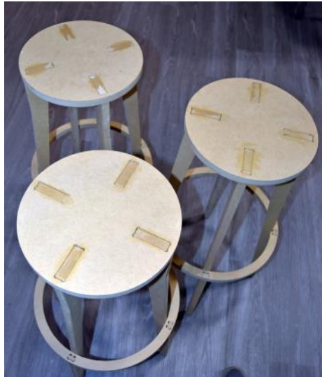
Prototype Stools - Mike Hanes Termite Barf (MDF) - None