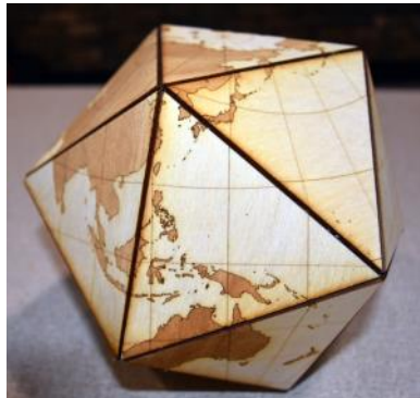
Dymaxion Globes - Mike Hanes Baltic Birch Ply - None