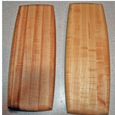
Cutting Boards - Rich Ogren