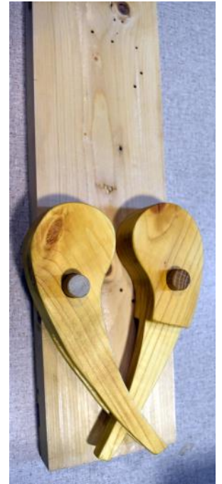
Comma Clamp - Jim Harvey Scrap Wood - BLO