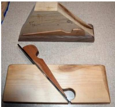
Plane - Andrew Fitch Maple & Mag - Oil