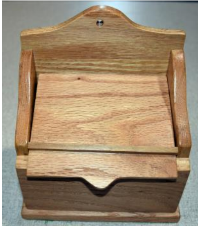
Recipe Box - Paul Kricensky Red Oak - Poly, satin finish