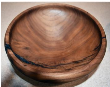
Walnut Bowl - Kyle Hansen Walnut - Danish Oil