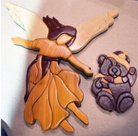
Angel & Bear Intarsia Wood Art - Rich Rossio