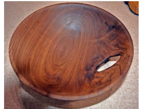
Walnut Bowl - Kyle Hansen Walnut - Danish Oil