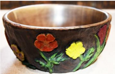
Carved Walnut Bowl - Bert Le Loup Black Walnut - Acrylic Paint, Turners Fin. & Wax