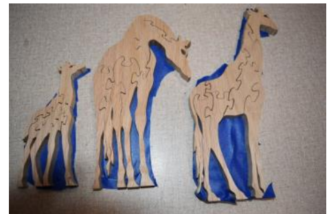
Giraffe Family - Tom Olson Red Oak - None