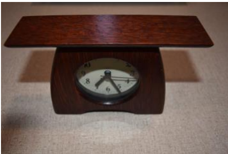
Clock