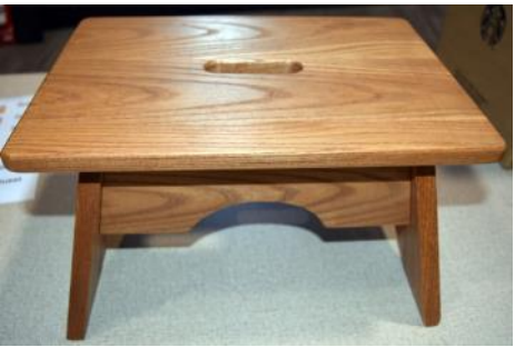
Step Stool - Ken Everett Oak - Poly.