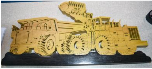
Scroll saw Loader Truck - Roy Galbreath Hedge & Wedge - Spray Poly