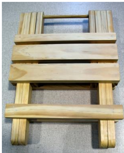
Easy Carry Stool - Ken Everett Pine (New Zealand) - Sealer