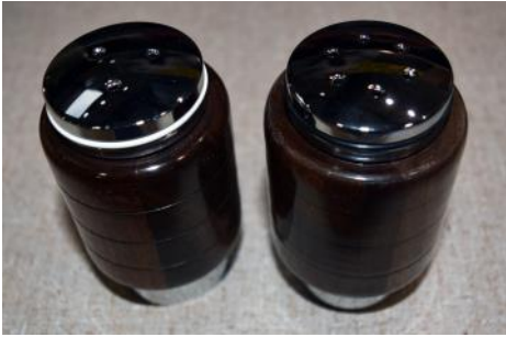
Salt & Pepper Shakers - Al Cheeks Black Walnut - CA