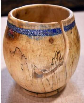
Bowl for Knitting Ball - Bert Le Loup Spalted Ash - Turners Finish