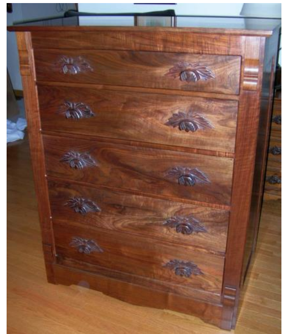
Walnut Dresser - Mike Kalscheur Walnut -