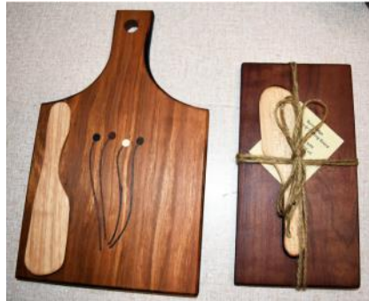
Cheese Cutting Boards - Ed Buhot Mixed - Olive Oil