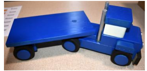
Toy Truck - Lee Nye Pine - Spray Paint