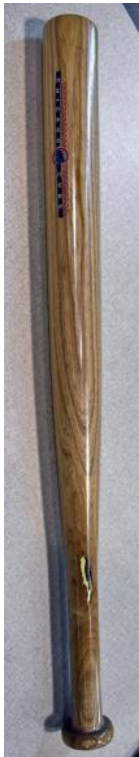
Bat - Tony Leto Ash - Wipeon poly