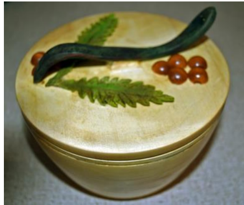
Turned Box with Lid Bert Le Loup Box Alder - Turners Finish