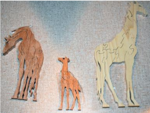
Puzzles - Dennis Devitt Oak & Poplar - Poly