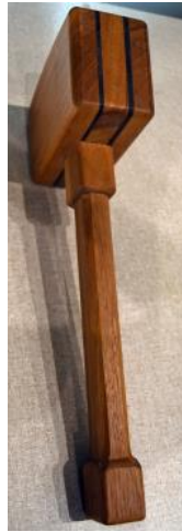
Hammer - OBrian Hickory - BLO