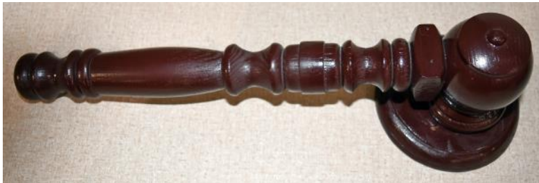
Gavel - Bob Bakshis Oak & Poplar - Paint