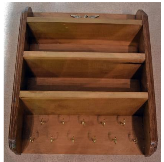
Key Rack - Tony Leto Oak & Poplar - Water Poly