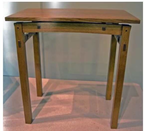
Small Table - Wayne Maier White Oak - Lacquer