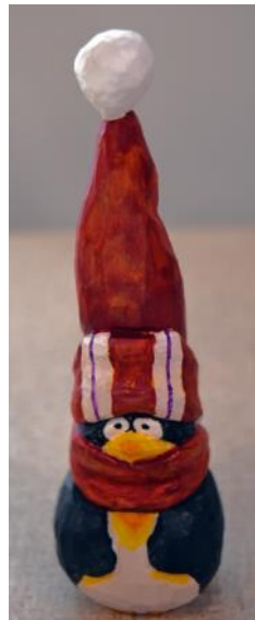
Carved Penguin Whit Anderson Basswood - Acrylic Paint