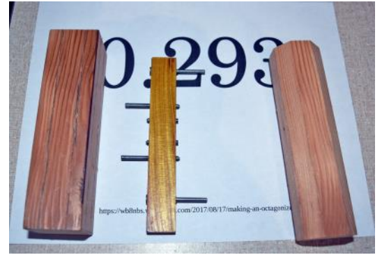
Octagonizer - Jim Harvey Osage - BLO