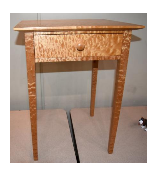
Small Table - Wayne Maier Quilted Maple - Oil / Varnish