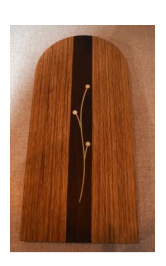
Cutting Board - Ed Buhot Oak, Walnut & Holly - Mineral Oil