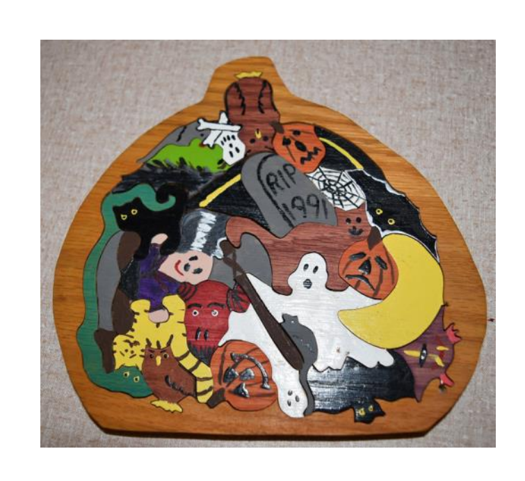
Halloween Puzzle - Rich Rossio Oak - Acrylic paint