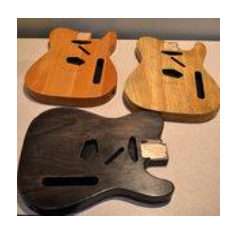
Guitar Bodies - Will Brethauer Ash & Alder - General Finish Stain