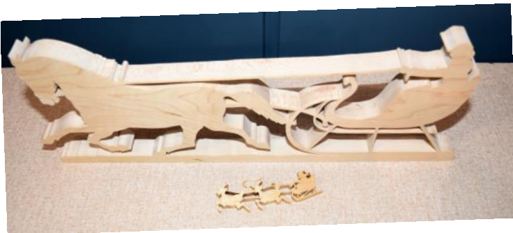
Horse & Sleigh - Roy Galbreath Maple