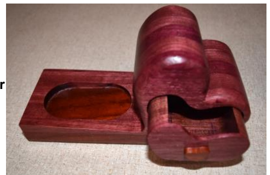
Heart Band Saw Box - Zach Belzer Purple Heart & Padauk - Lacquer Spray & Sanding Sealer