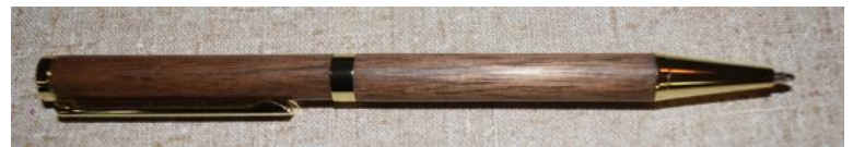
Turned Pen - Tom Benson Walnut & Oak - Hut