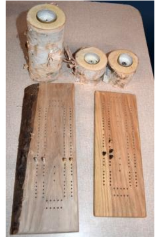
Easy Gifts - Andrew Fitch Oak, Walnut & Birch - Tung Oil