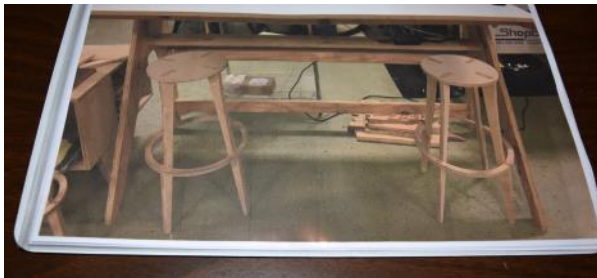
Two Station Computer Desk - Mike Hanes Melamine & Ply. - None