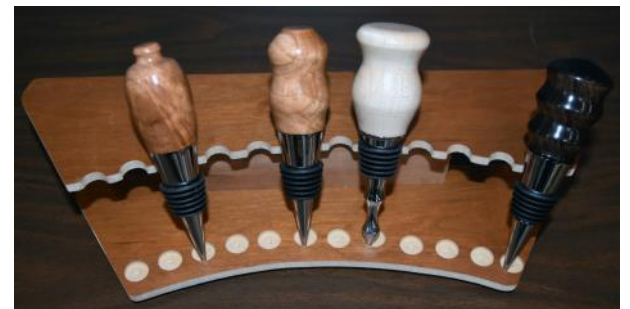
Bottle Stoppers - Ken Everett Various - Hylands Wax Polish