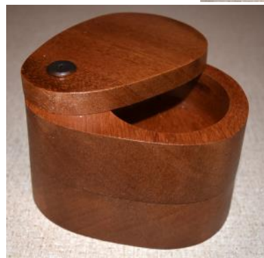
Salt Cellar Band Saw Box Zach Belzer African Mahogany - Lacquer Spray