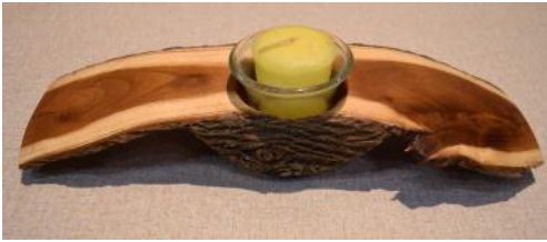
Candle Holder - Rich Rossio Osage Orange - Watco