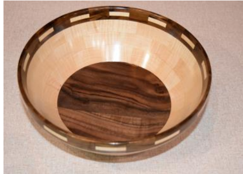
Segment Bowl - Ed Buhot Tiger Maple & Walnut - Gen Wood Turners Finish