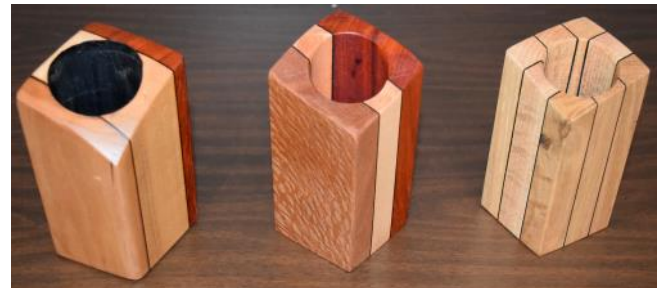
Pencil Holders - Peter D'Attomo Mixed Wood - Wipe on Poly.