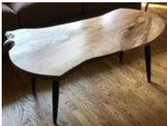
Coffee Table - George Rodgers Turkish Hazelnut & Cherry - Gel Varnish, Ebonized Cherry With Acrylic