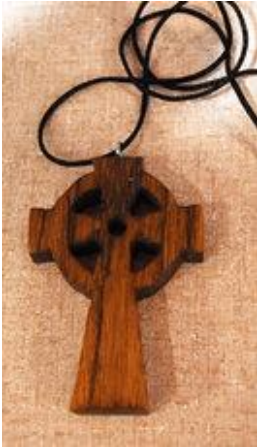
Celtic Cross Pendant - Bob Bakshis Oak - Poly