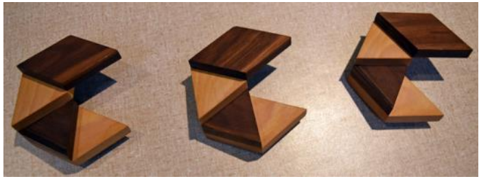
Puzzle - Apart - Rich Rossio Walnut & Maple - Wipeon Poly