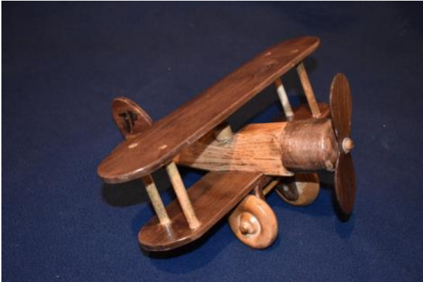
Toy - Tim McAuley Oak/Walnut - Poly