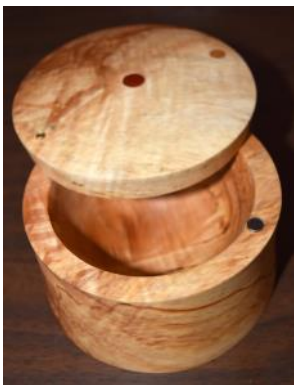
Salt Cellar - Peter D'Attomo Spalted Chestnut - Salad Bowl