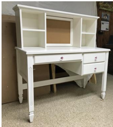
Child's Desk - Lee Nye Various Scrap Wood - S-W Latex Enamel