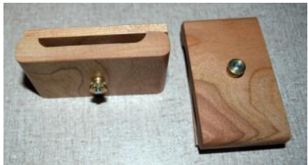
Quilt Hanger Clamps - Ken Everett Cherry - Poly Wipe Oil