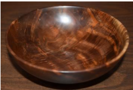
Bowl - Kyle Hansen Walnut & Maple - Oil & Wax