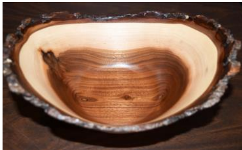
Turned Natural Edge Bowl - George Rodgers Walnut - Deft Lacquer