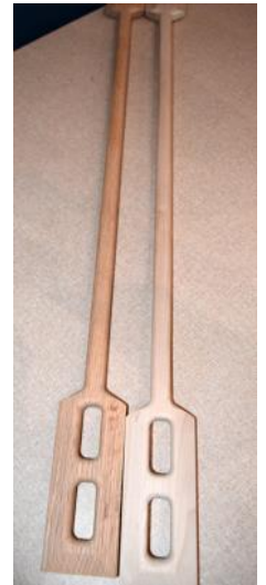
Homemade Mash Paddles Jim Arendt Maple & Oak - None