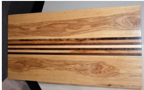
Table - Will Brethauer White Oak - General Finish