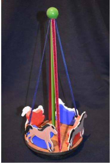
Toy - Tim McAuley Oak/Walnut - Poly