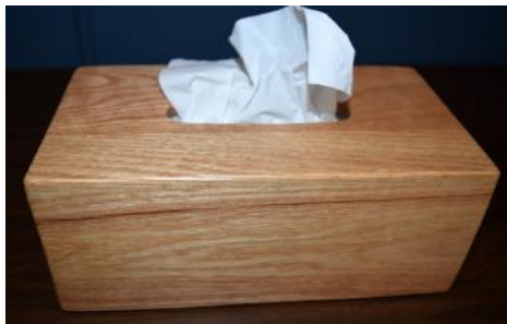
Kleenex Box - Paul Kricensky Red Oak - Poly Satin Finish