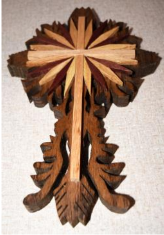
Celtic Cross - Bob Bakshis Oak & Purpleheart - Poly