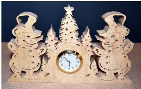
Snowman Clock - Roy Galbreath Maple - None