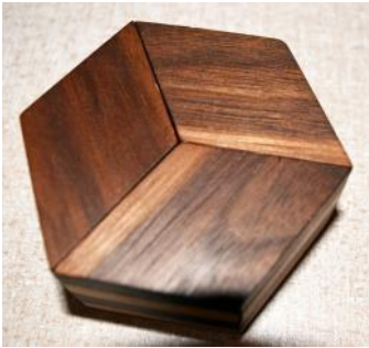
Puzzle - Complete - Rich Rossio Walnut & Maple - Wipeon Poly