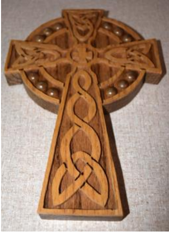
Celtic Cross - Bob Bakshis Oak - Poly