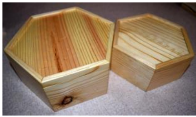
Hexagonal Boxes - Jim Harvey Cheap Pine - Watco - Wax