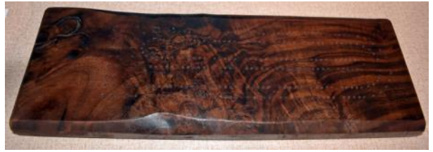
Cribbage Board - Harry Trainor Walnut Burl - Deft Lacquer