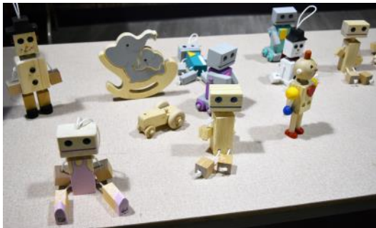
Some of the toys on display during the march meeting...

The DPWW toy committee will be hosting a toy making workshop on Saturday, April 28, 2018 from 9am to 3pm at the Woodcraft Store in Woodridge. Please sign up for a shift(s) from 9am-noon or from noon to 3pm. A sign-up sheet will be available at the next general meeting on Monday, April 16. If you are unable to attend the general meeting but still want to participate in the toy making workshop please contact George Rodgers at 708-623-9038 or glrodders@comcast.net Our goal is to again provide at least 1,500 toys to disadvantaged children in the great Chicagoland area during the Christmas season. Never too soon to begin!