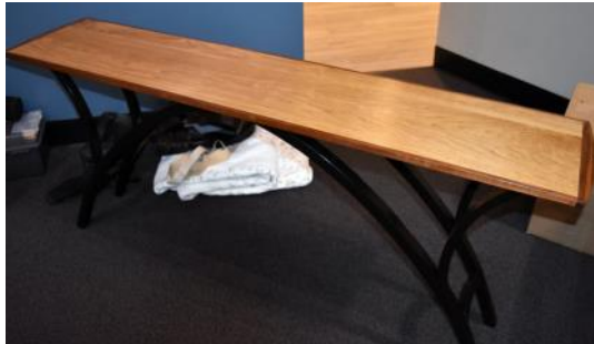
Table - Bert LeLoup White Oak/Walnut Trim - Nat. Stain/ Varnish