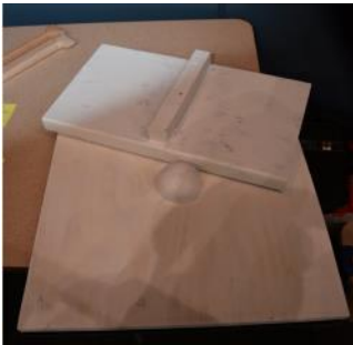
Wobble Boards - Keith Rosche Scrap Wood - Primer