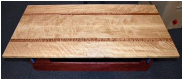
Table - Will Brethauer Ash - General Finish