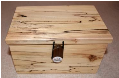
Beads of Courage Box - Mike Kalscheur Spalted Elm - Water Based Polyacrylic