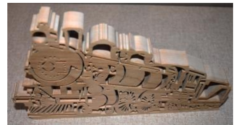
Scroll Saw Train Roy Galbreath Maple