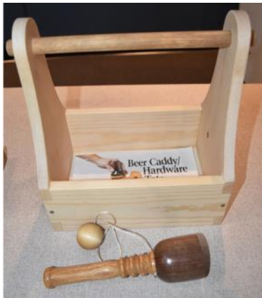
Tote & Toy - Mike Kalscheur Pine, Walnut & Oak Poly on Toy