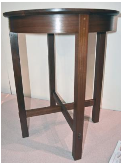
Small Table - Wayne Maier Walnut - Shellac