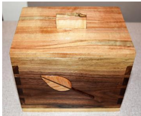
Beads of Courage Box Ed Buhot Walnut & Spalted Maple