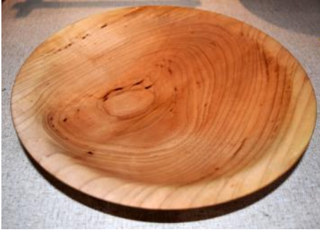
Bowl - Rick Ogren Soft Maple - WipeOn Poly