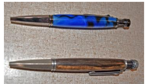
Pens - Tony Leto Plastic -