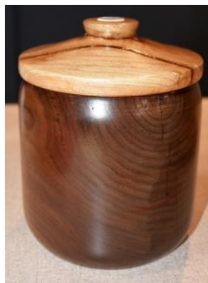
Beads of Courage Box Rich Rossio Walnut & Maple - Watco