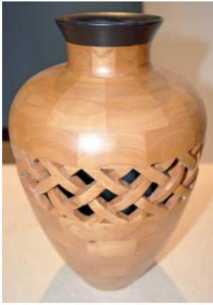
Cherry Vase - Jerry Kuffel Cherry - Lacquer