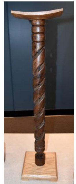
Candle Holder - Peter D'Attomo Oak & Maple - WipeOn Poly