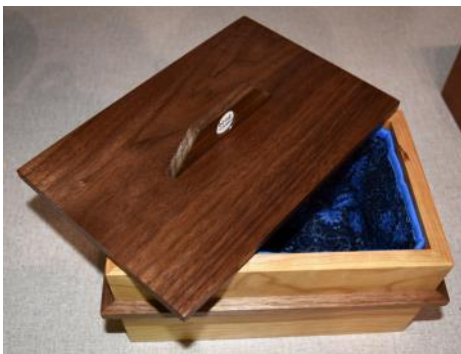
Beads of Courage Box Ken Everett Cherry & Walnut - Shellac