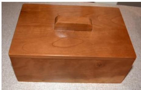
Beads of Courage Box Curt Vevang Cherry - Poly