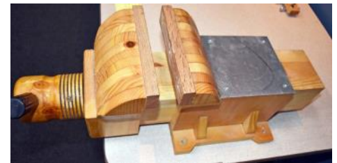
Wood Vise - OBrian Parks Pine -