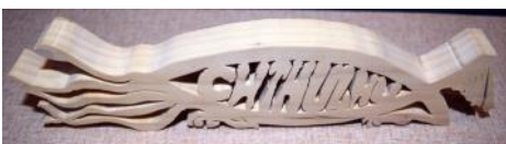
Scroll Saw Fish - Will Brethauer Poplar -