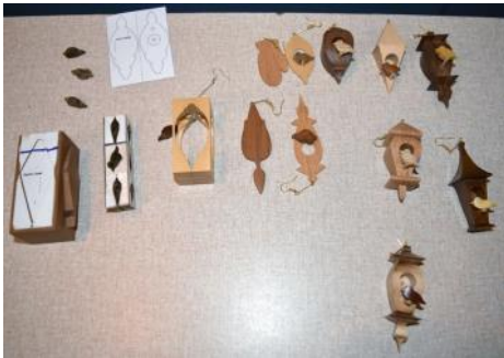
Miniature Bird Houses - Roy Galbreath Oak, Walnut & Cherry - Spray Poly