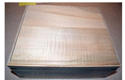
Box - Bruce Wick Hard Maple - Unfinished