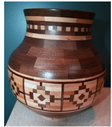
Segmented Vase - Jerry Kuffel Walnut & Maple - Satin Lacquer