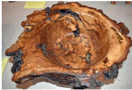
Cherry Burl Bowl - Rich Rossio Cherry - Watco