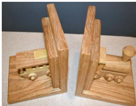
Train Bookends - Paul Kricensky Red Oak - Satin Poly