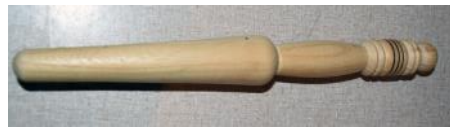
Guess - Don Burgeson Maple - Wax