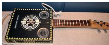
Cigar Box Uke - Will Brethauer Ash & Walnut - Tru-oil