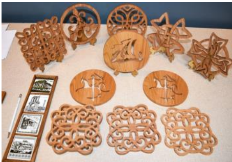
Trivets - Bob Bakshis Oak - Mineral Oil