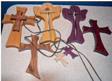
Crosses - Jim Leifel Purple Heart & Oak - Poly