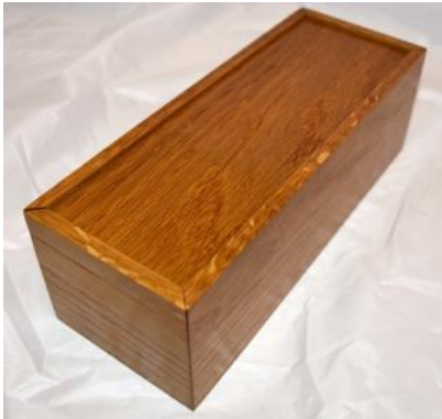
Box - Jim Harvey Red Oak - Ammonia, Watco & Wax