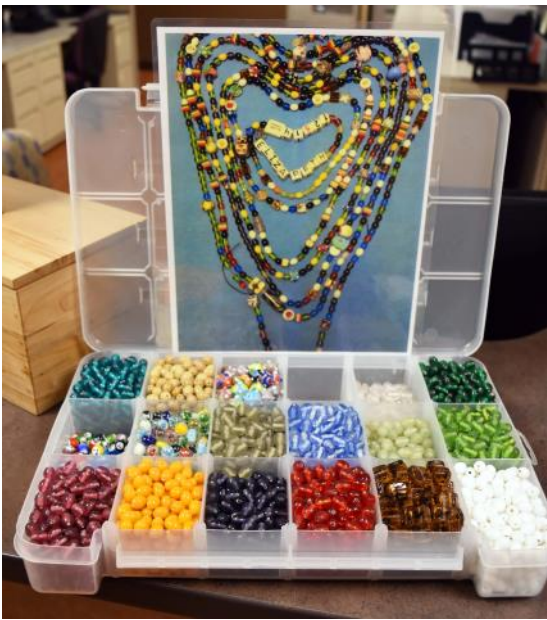
One of the boxes of different beads for the Children

This is for a good cause and also many members can find a good place for one of their creations. I know, I have lots of items just collecting dust in my home. Below are some of the pictures from our morning at the Hospital..