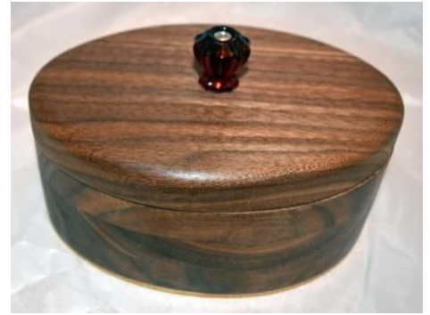
Band Saw Box - Paul Kricensky Walnut - Poly Satin