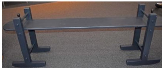
Juggling Board - Don Burgeson Poplar (African Blackwood Handles) - Charleston Green Paint