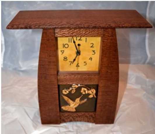
Clock - Wayne Maier Leopard Wood - Waterlox