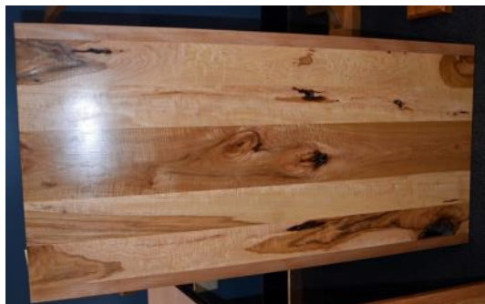
Table Top - Will Brethauer Rustic Hickory & Sycamore - Arm-r-seal