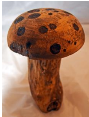
Mushroom Peppercorn Bert Le Loup Ash - Walnut Stain & Wipe-on Varnish