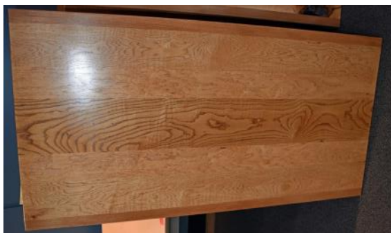
Table Top - Will Brethauer Ash, Hickory & Sycamore - Nutmeg