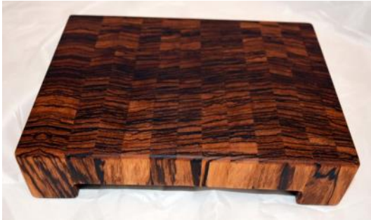
Cutting Board - Rick Ogren Zebra Wood - Mineral Oil