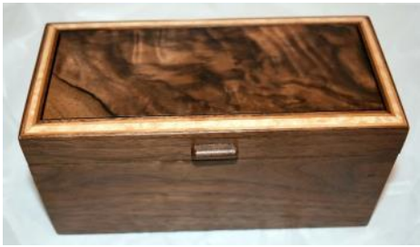
Jewelry Box - Jerry Kuffel Walnut, Maple & Cherry - Satin Lacquer