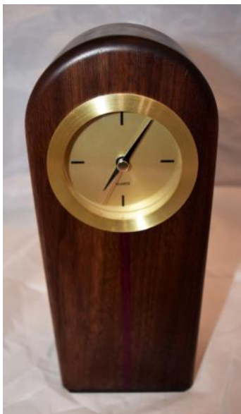
Mantle Clock - Al Cheeks Walnut & Purpleheart Brush Oil Polish