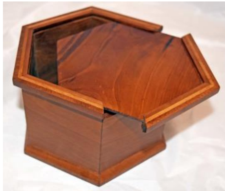
Box - Jim Harvey Cherry - Ammonia, Watco & Wax