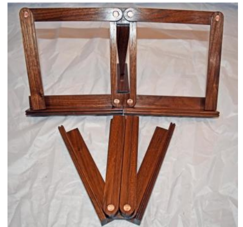
Folding Book Stand Jim Harvey Walnut - Watco & Wax