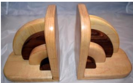
Art Deco Bookends Paul Kricensky Maple & Walnut - Satin Poly / Min wax