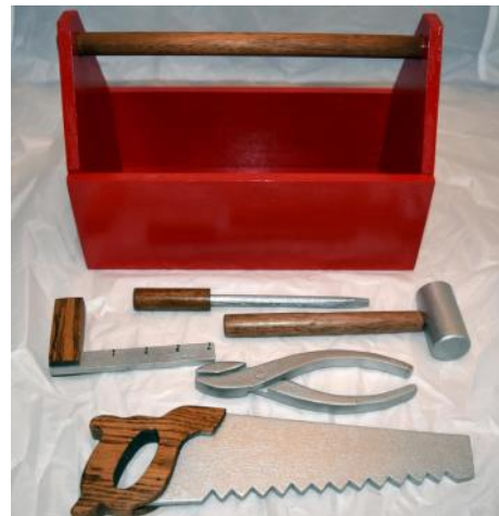
Tool Box & Tools Bob Bakshis Various - Various