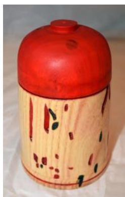
Box - Peter D'Attomo Sycamore - Stain & Oil