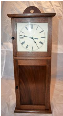
Shaker Clock Wayne Maier Walnut - Shellac