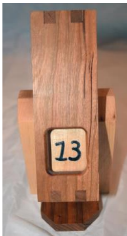
Calendar OBrian Parks Cherry & Maple - Spray Poly