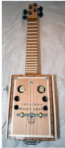
Uke Will Brethauer Maple & White Oak Arm-R-Seal