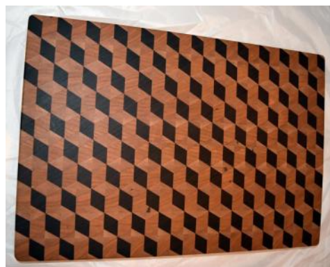
3D Cutting Board - Mike Kalscheur Walnut, Cherry & Maple - Mineral Oil