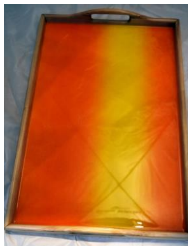
Serving Tray - George Rodgers Ambrosia Maple - Arm-R-Seal