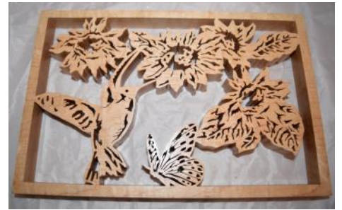
Hummingbird & Flowers Roy Galbreath Maple - Spray Poly