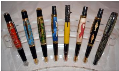
Pens - Paul Pyrcik Various Acrylic - CA