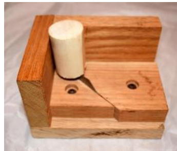
Center Finder Jig Bob Bakshis Scrap Oak