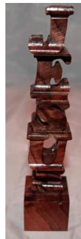
Word Art Will Brethauer Walnut - Shellac