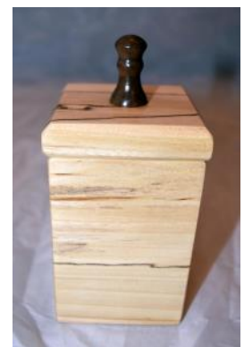
Small Box - Mike Kalscheur Spalted Elm - Poly