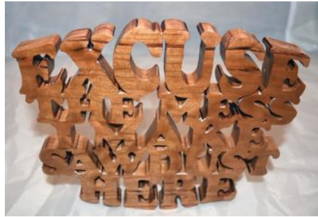
Novelty Sign Will Brethauer Cherry - Shellac