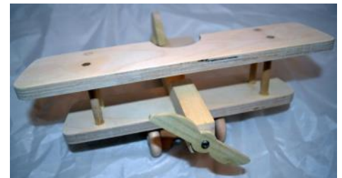
Toy Bi Plane - Tom Olson Pine, Poplar & Baltic birch