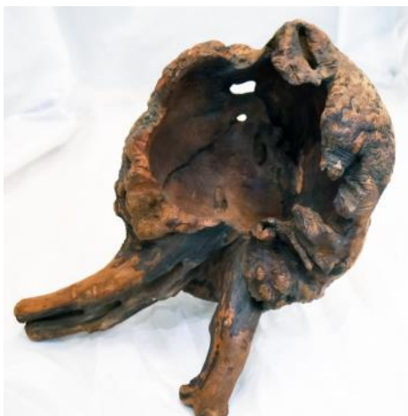
Hollowed Burl - Bert Le Loup ?? - Turners Finish