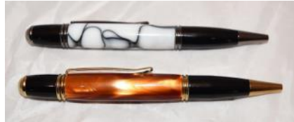
2 Gatsby Pens - Tom Benson Acrylic Copper Pearl & Pure White with Black Thread