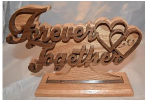
Forever Together Sign - Tom Olson Walnut & Oak - Deft