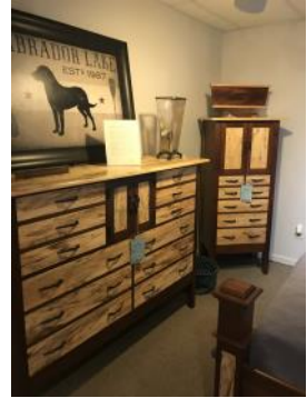
Amana Furniture Made Spalted Maple

The next stop was Des Moines. We enjoyed a nice dinner at the Machine Shed Restaurant and then went to the Woodsmith Store for a workshop on: “Tuning and Using Hand Planes.”