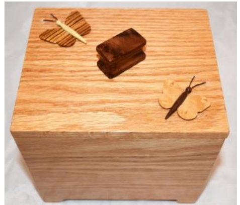
Beads of Courage Box - Ed Buhot Oak, Walnut & Micro Veneers Varathane Poly