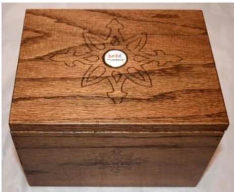
Beads of Courage Box Bob Bakshis Oak - Poly.