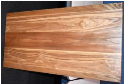
Table Top - Will Brethauer Ash & Slippery Elm - Arm & Seal Gloss