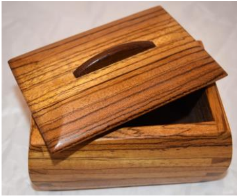
Beads of Courage Box Wayne Maier Zebra Wood - Shellac