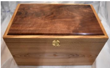
Jewelry Box - Mike Kalscheur Catalpa & Walnut - Oil & Poly