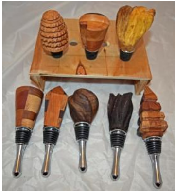
8 Bottle Stoppers - Bert Le Loup Variety of Wood - Deft