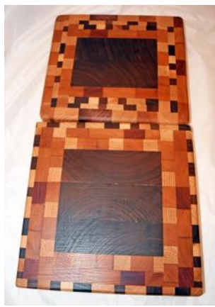
2 Endgrain Cutting Boards - Bert Le Loup Walnut & White Oak Butcher Block Oil