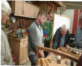
Workshop at the Woodsmith Store