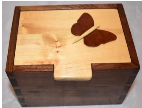
Beads of Courage Box - Ed Buhot Walnut & Maple - Miniwax & Poly