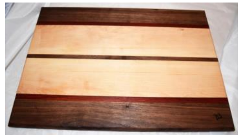
Cutting Board - Zach Belzer Walnut, Cherry & Padauk Walrus Oil & Walrus Wax