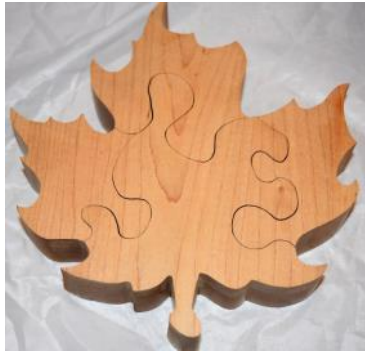
Maple Leaf - Roy Galbreath Maple