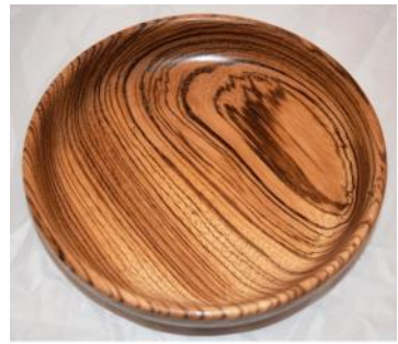
Bowl (Golf Outing) - Nathan Wick Zebra Wood - Oil