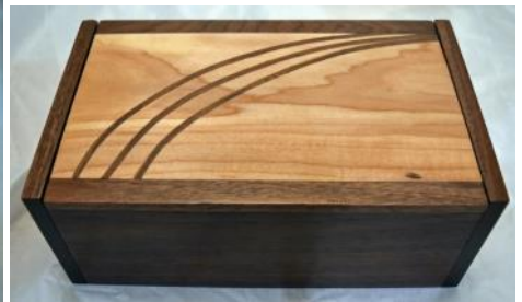
Jewelry Box - Jerry Kuffel Maple & Walnut - Lacquer