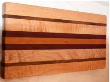
Cutting Board - Harry Trainor Maple, Walnut Cherry & Purpleheart Mineral Oil & Wax