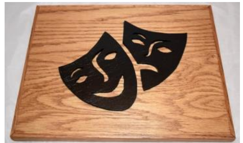
Tragedy - Comedy Plaque Bob Bakshis Oak & Ply - Acrylic Poly