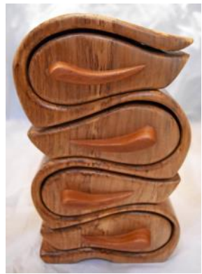
Bandsaw Bow - George Rodgers Spalted Maple - Wipeon Poly & Flocking