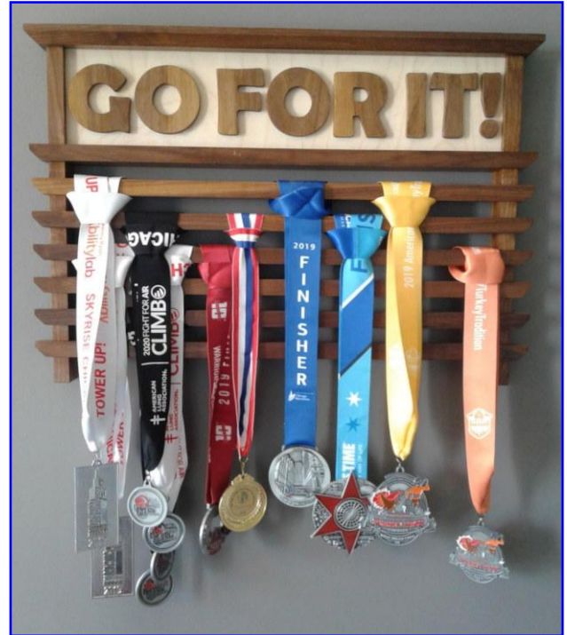
OBrian Parks - Medal Display Walnut - Amber Shellac