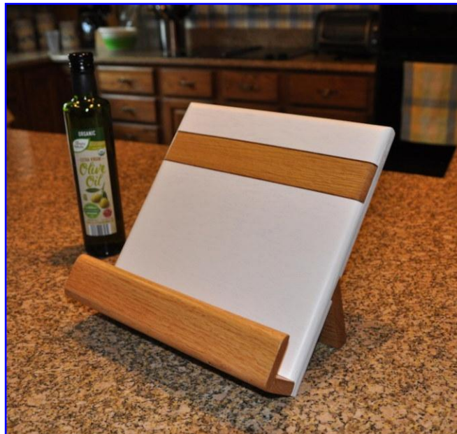
Lee Nye - Cookbook Stand Plywood, White Oak - Paint, Wipeon Poly