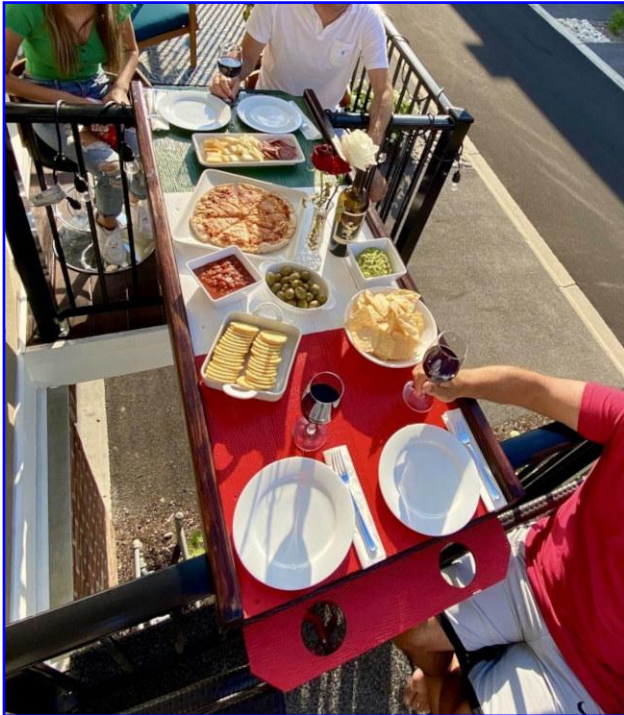
Paul Colombo - Balcony Tray Table Cedar, Plastic Composite - Deck Stain

If you're not connected to the Forum at dupagewoodworkers.org , you can submit photos of your current projects via Google Forms for inclusion in next month's newsletter and our online From Our Workshop.