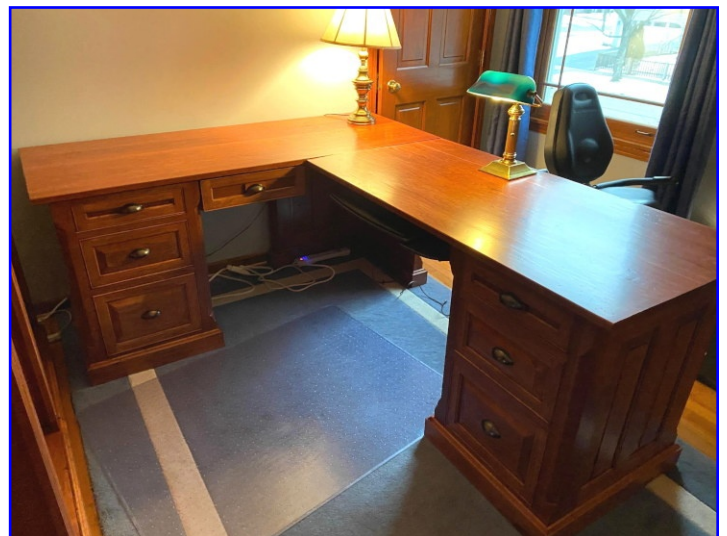
Jim Simmnick - L-Desk Cherry, Poplar- Gel Stain, Poly