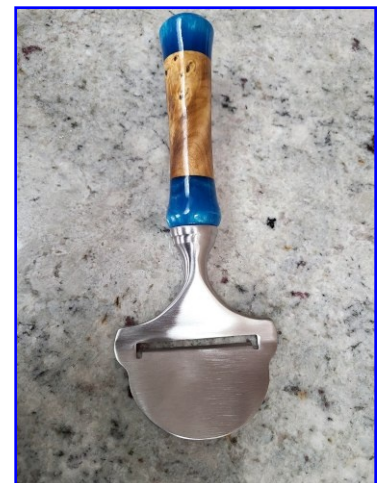
Kevin Lowe - Cheese Slicer Buckeye Burl, Urethane - Poly