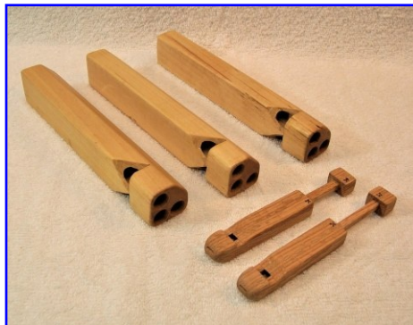
Mike Kalscheur - Toy Whistles Oak, Basswood - Watco Oil