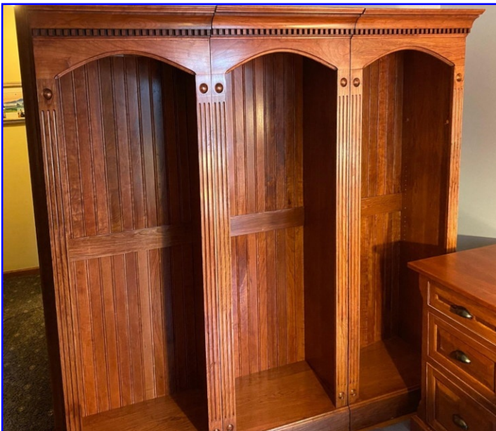
Jim Simmnick- Book Case Cherry, Cherry Ply- Gel Stain, Poly