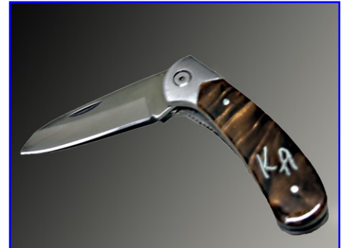
Jerry Kuffel - Pocket Knife Walnut, Aluminum - Lacquer