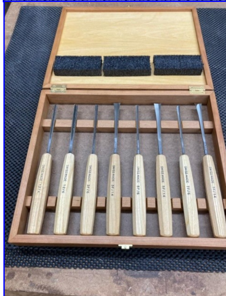
George Rodgers- Chisel Box 2 Cherry, Basswood - Shellac, Lacquer