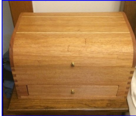
Mike Chole - Jewelry Box African Mahogany- Arm R Seal