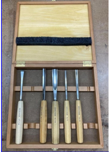
George Rodgers- Chisel Box 1 Cherry, Basswood - Shellac, Lacquer