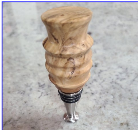
Kevin Lowe - Bottle Stopper Buckeye Burl - Wipeon Poly