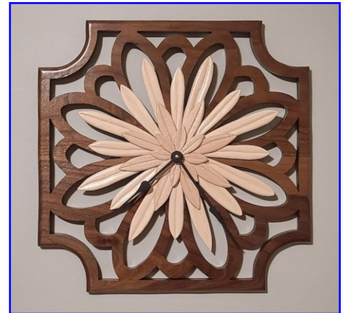
Michael Fornaciari - Clock Walnut, Maple - Arm-R-Seal