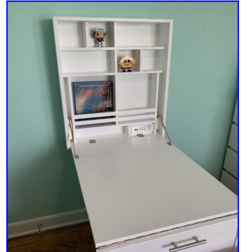
Frank Peterson - Fold Down Desk Hard Maple - White Poly Sprayed