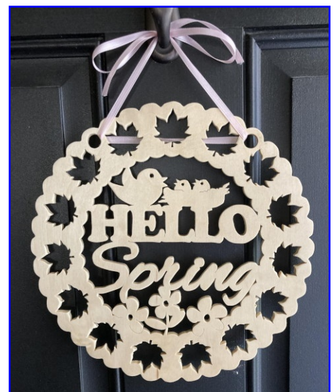
Bruce Metzdorf - Door Decoration Plywood - Spray Lacquer