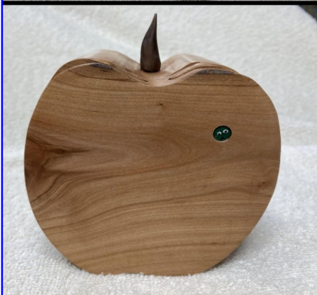
Bruce Metzdorf - Bandsaw Box Apple - Gel Poly