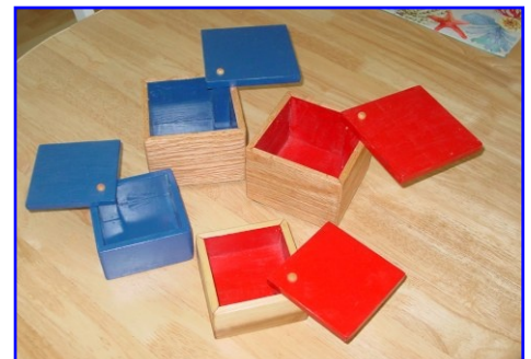
Tony Evansky - Red & Blue Boxes