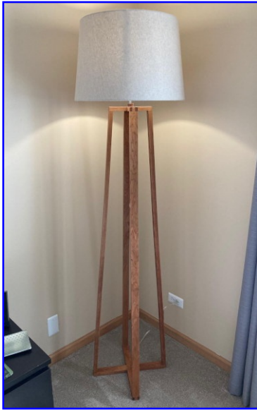
Emilian Geczi - Floor Lamp Cherry - Tung Oil, Wax