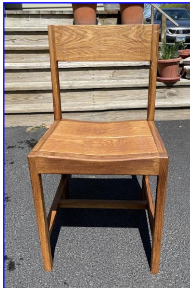
Mike Chole - Deck Chair White Oak - Ready Seal