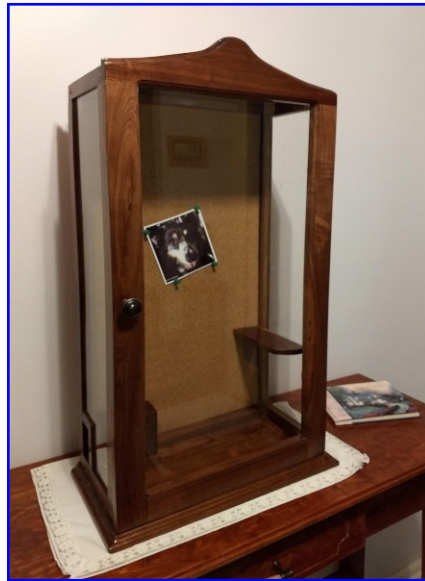
Tim McAuley - Shadow Box Walnut - Lacquer