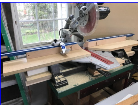
Mark Wieting - Miter Saw Table Salvaged Shelving - No Finish