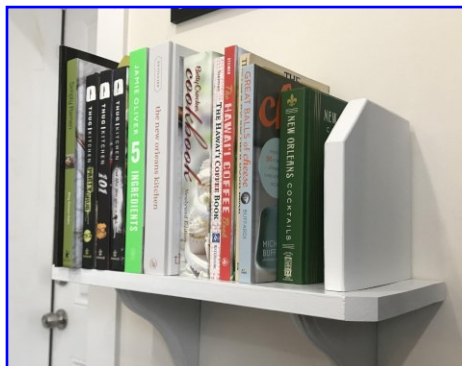
Mark Wieting - Cookbook Shelf Poplar - Undercoat, Enamel