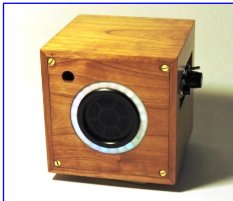
Jim Harvey - Bluetooth Speaker Cherry - Watco Oil, Wax