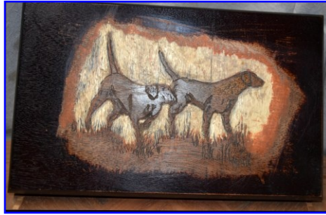
Bert LeLoup - Cigar Box Carving Cigar Box - Tru-Oil