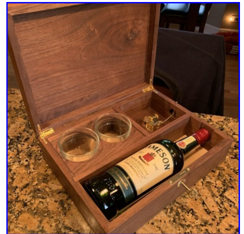
Craig Bixler - Whiskey Box Walnut, Maple - OSMO Oil