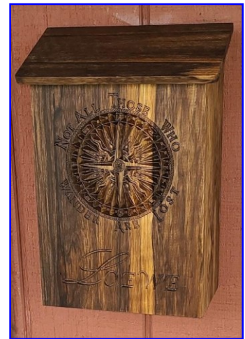
Kevin Loewe - Mailbox Black Limba - Tung Oil