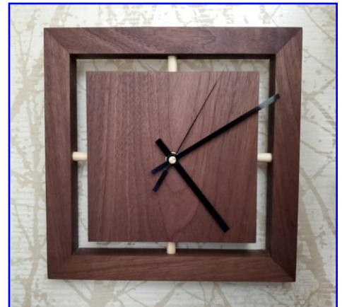
Al Cheeks - Clock Walnut - Gel Poly Stain