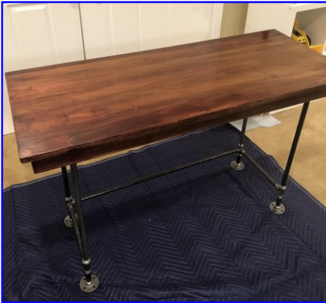
Patrick Kirchner - Desk Poplar - Minwax Espresso