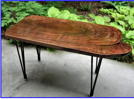
Mike Kalscheur - Side Table Walnut slab - Watco and Poly