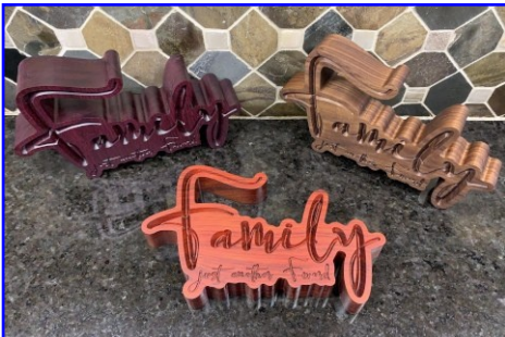
Marqus McPherson - "Family" Padauk, Purpleheart, Walnut Walrus Oil