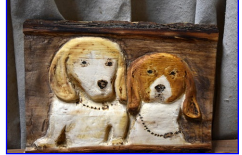
Bert LeLoup - Dogs Carving Basswood - Stains