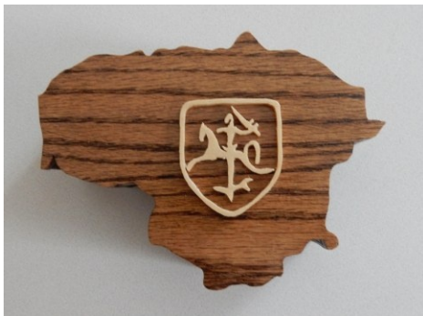
Bob Bakshis - Box Map, Lithuania Oak - Poly