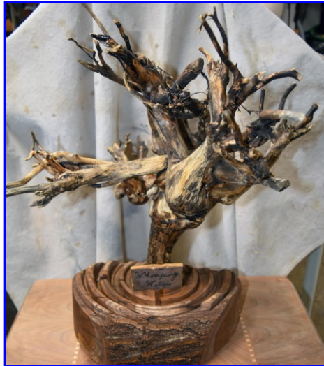
Bert LeLoup - Womping Willow Walnut, Tree Root - Stain, Sealer