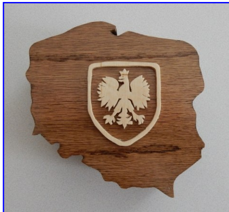
Bob Bakshis - Box Map, Poland Oak - Poly