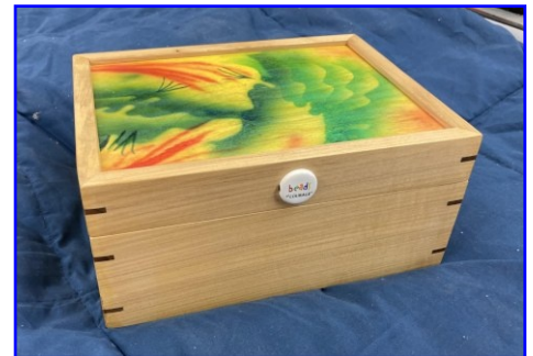
George Rodgers - BOC Box Maple, Walnut, Plywood - Airbrush, Lacquer, Shellac