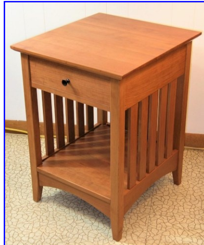
Mike Kalscheur - Side Table Cherry - Gel Stain, Wipeon Poly