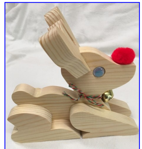
Pat McGrath - Xmas Gifts Various Wood - No Finish