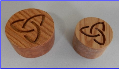
Bob Bakshis - Celtic Knot Boxes Oak - Poly