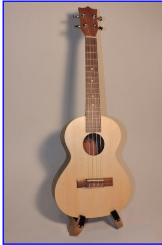
Jim Harvey - StewMac Tenor Ukulele Kit Spruce, Pacific Walnut - Formbys Tung Oil