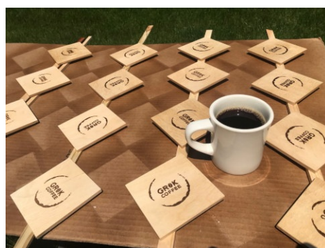
Mark Wieting - Coffee Coasters 1/8" Ply - Lacquer & Poly