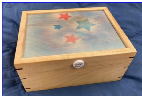
George Rodgers - BOC Box Maple, Walnut, Plywood - Airbrush, Lacquer, Shellac