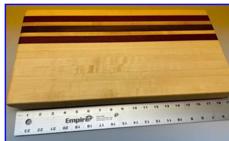
Harry Trainor - Cutting Board Cherry, Maple, Walnut, Purpleheart - Howards Butcher Block Conditioner