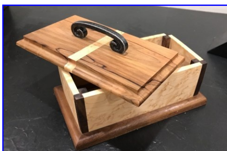
Marty Dettmer - BOC Box Birdseye Maple, Walnut - Furniture Polish