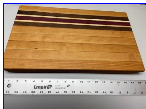
Harry Trainor - Cutting Board Maple, Walnut, Purpleheart - Howards Butcher Block Conditioner