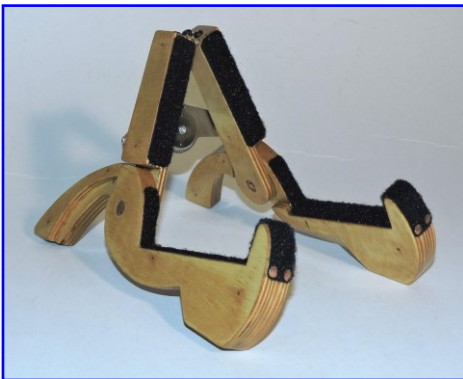
Jim Harvey - Folding Uke Stand 1/4" BB Ply - Rattle CanLacquer