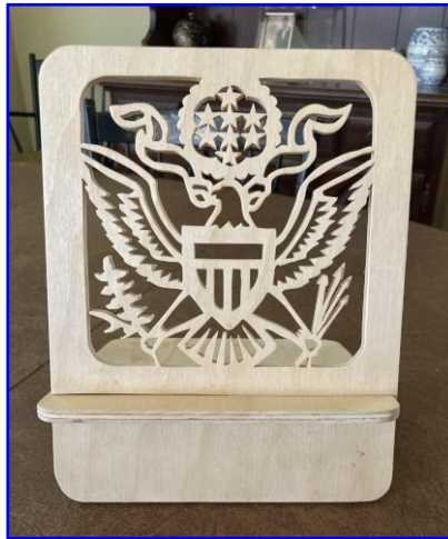
Bruce Metzdorf - iPad Stand Plywood - Danish Oil