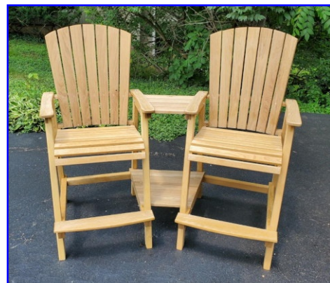
Al Cheeks - Adirondack Chairs White Oak - Unfinished