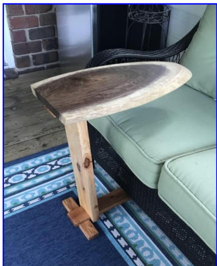
Ron Colliander - Snack Table Walnut, Pear - Satin Poly