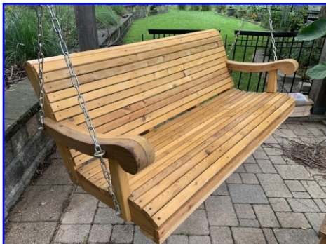
Bill Hoffman - Porch Swing Cedar - Gen Fin Exterior 450