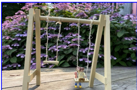
Mike Perry - Playmobile Swing Scrap Trim - Spray Paint