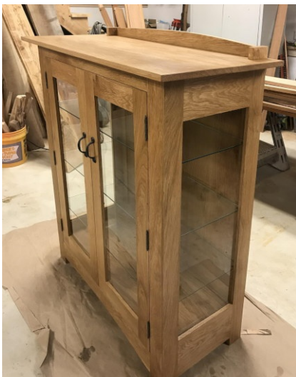
Ron Colliander - Curio Cabinet White Oak - Satin Poly