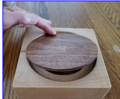
Bert LeLoup - Turned Man Hole Cover Box White Oak, Walnut - Watco