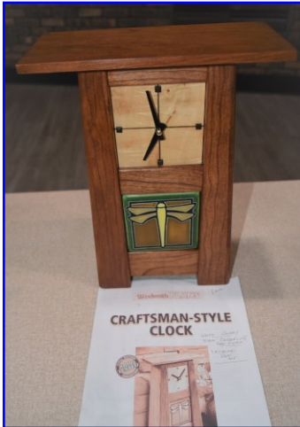
Rick Ogren - Clock with Tile Insert