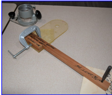
Don Carkhuff - Circle Cutting Jig