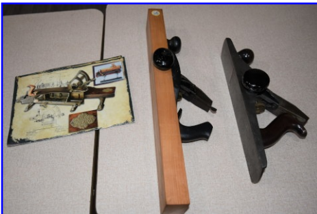
Don Carkhuff - Shooting Board Planes