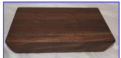
Harry Trainor - Cutting Board