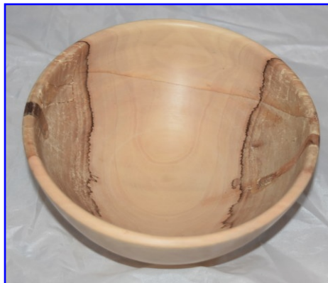
Bert LeLoup - Bowl Spalted Maple