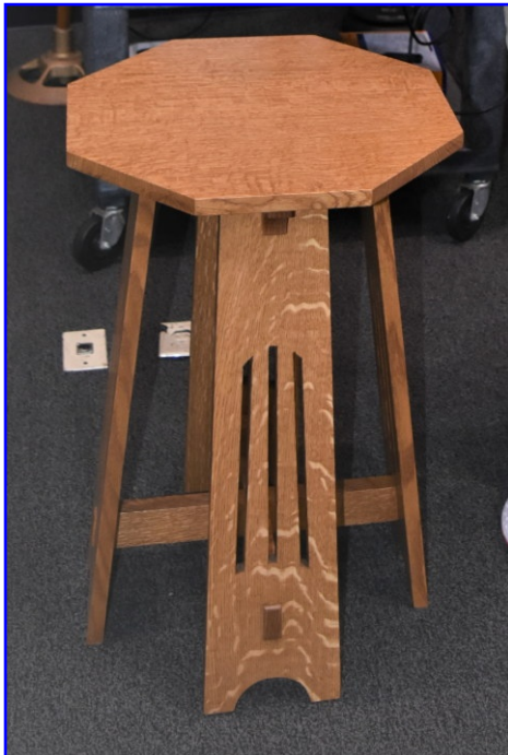
Wayne Maier - End Table White Oak