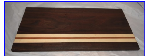
Harry Trainor - Cutting Board