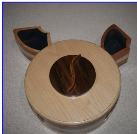
Tom Olson - Magnetic Box