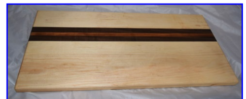
Harry Trainor - Cutting Board