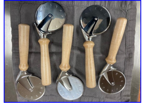
George Rodgers - Pizza Cutters Maple - Minwax Poly