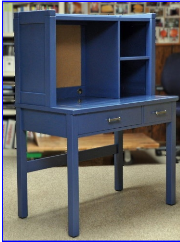
Lee Nye - Student Desk Poplar and Plywood - Satin Paint