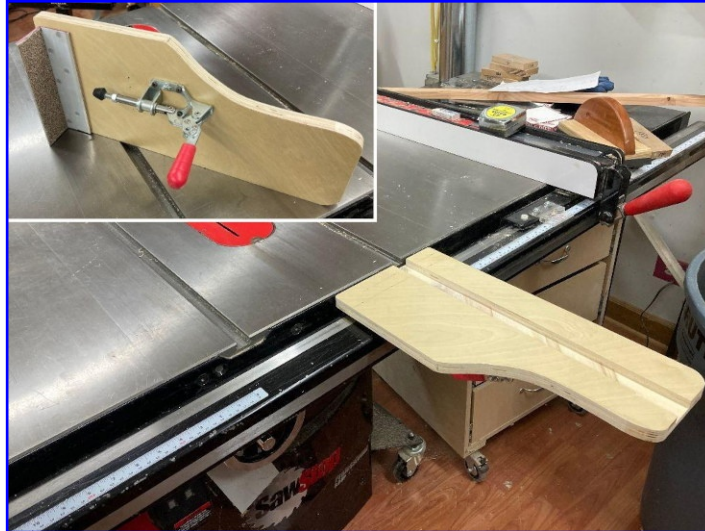
George Rodgers Infeed Platform Plywood, DeStaCo Clamp No Finish