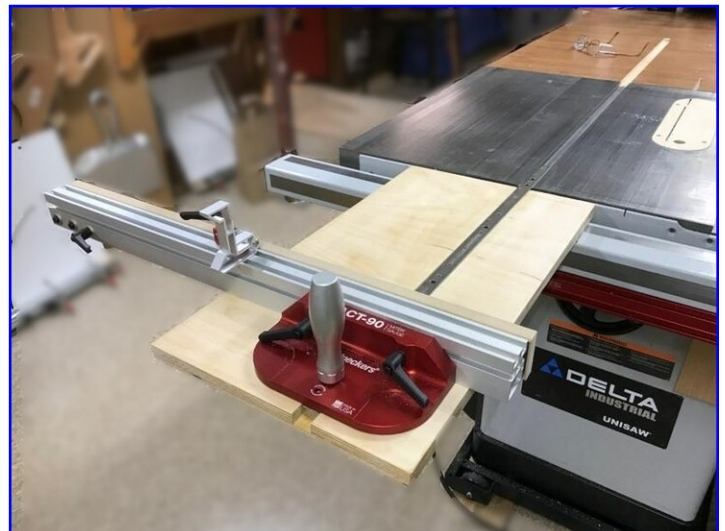
Lee Nye - Miter Extension Birch Ply - Shellac, Wax