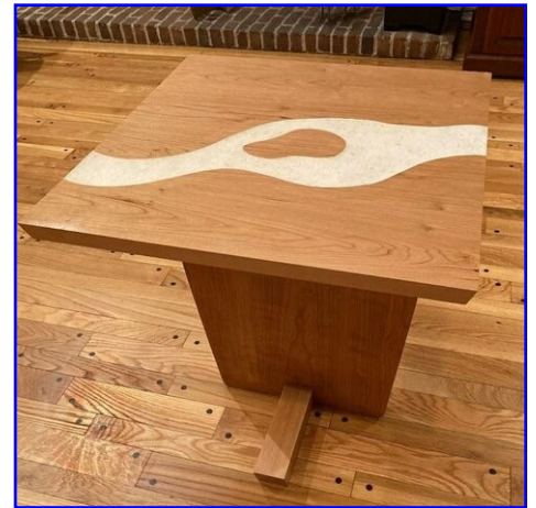
George Rodgers - Nakashima Style Table Cherry, Calcite, Mother of Pearl, Epoxy - Shellac, Waterlox