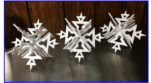
Lee Nye - Snowflakes 1/8" Birch - Shellac, White Paint