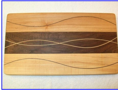
Mike Kalscheur - Woven Board Walnut, Maple - Oil & Wax