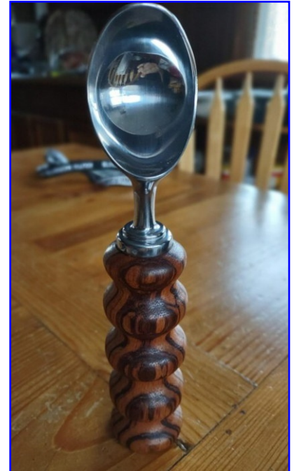
Ron Milford - Ice Cream Scoop Zebra Wood - Hut Crystal Coat