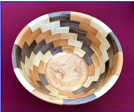
Jim Simnick - Segmented Bowl Walnut, Cherry, Maple - Tung Oil