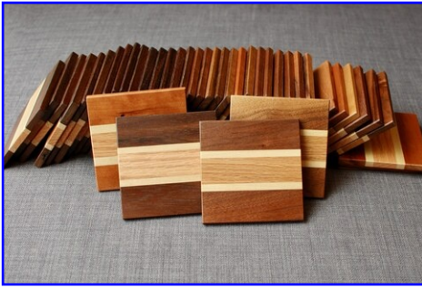
Emilian Geczi - Coasters Walnut, Oak, Poplar - Urethane