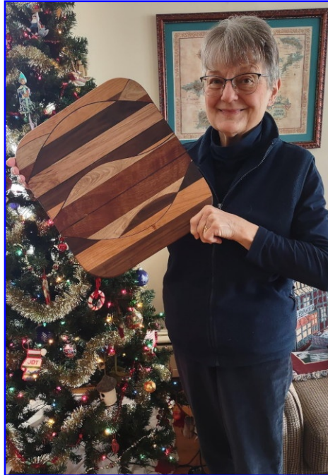
Ron Milford - Cheese Board Walnut, Birch, Rosewood, Maple, Ash - Mineral Oil