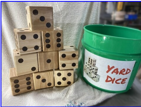
Bruce Metzdorf - Lawn Dice Ash, Walnut - Wipe On Poly