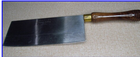
Tom Olson - Cleaver Handle Many Woods - Shellac, CA Glue