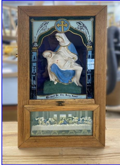
Mike Perry - Extreme Unction Cabinet Rebuild Birch Ply, Oak, Walnut - Shellac, Flock