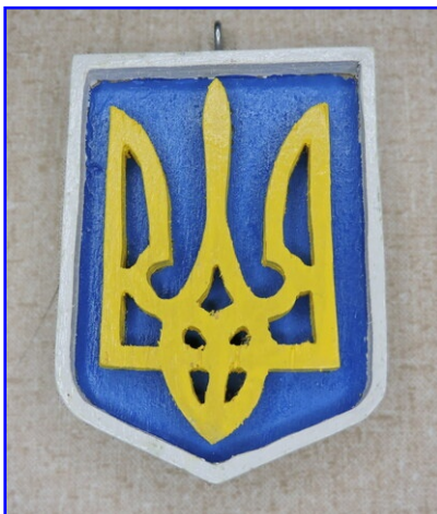
Bob Bakshis - Ornament Birch Ply - Paint, Poly