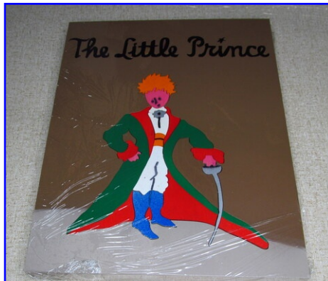
Rick Ogren - Puzzle Birch Ply - Paint