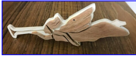
Lee Nye - Angel Ornament Cherry, Maple - Spray Lacquer