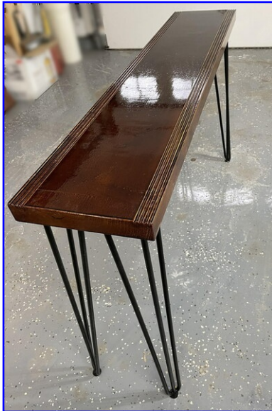
Mark Wieting - Sofa Table Spruce - Deft, StepSaver