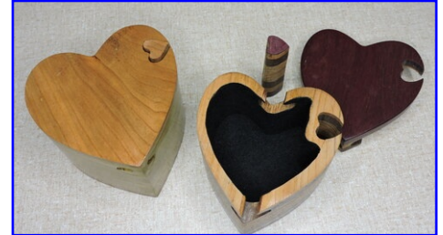
Tom Olson - Puzzle Boxes Many Woods - Shellac, CA Glue