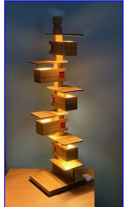
Bill Hoffman - Taliesin Lamp Cherry - Tried & True, Black Wax