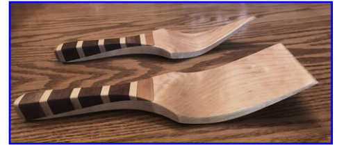
Lee Nye - Serving Utensils Maple, Walnut - Tried & True