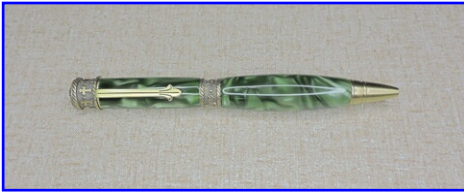
Tom Benson - Pen Acrylic