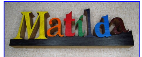
Rick Ogren - Name Butternut - Paint