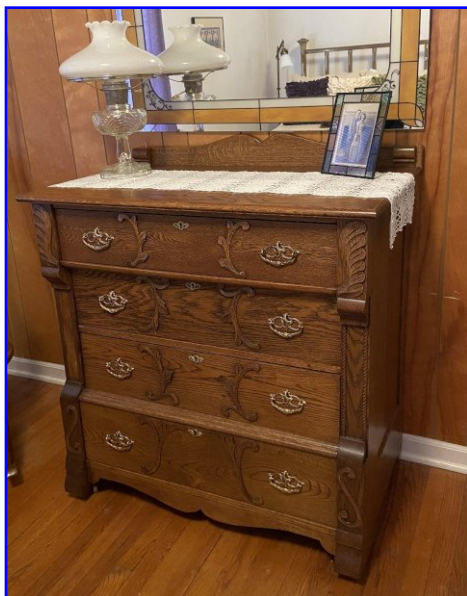
Rick Ogren - Dresser White Oak - Water Base Poly