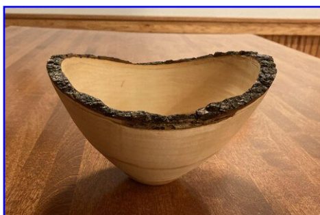
Don Pellegrini - Turned Bowl Box Elder - Walnut Oil