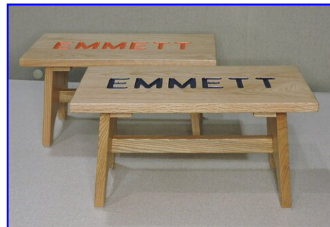
Dale Durfey - Step Stools Ash - Poly