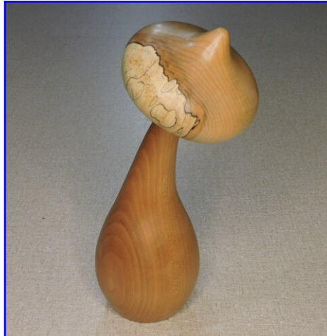
Paul Pyrcik - Mushroom Cherry - Deft