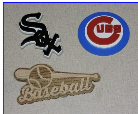
Bob Bakshis - Baseball Plaques Birch Ply - Craft Paint, Poly