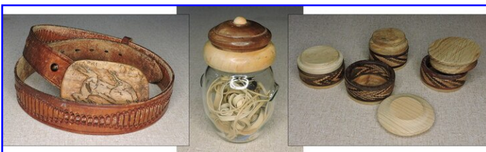
Bert Leloup Buckle, Jar Lid, Boxes Various Woods