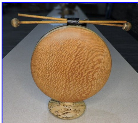
Bert Leloup - Center Piece Birdseye Maple,