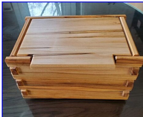
Al Cheeks - Keepsake Box Ambrosia Maple - Gel Poly