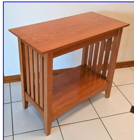
Mike Kalscheur - Cherry Side Table Cherry - Gel Stain, Poly