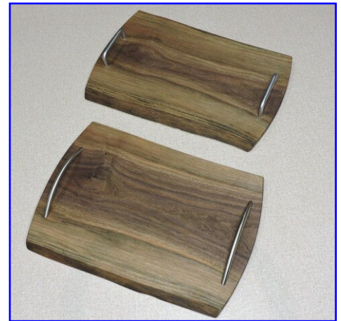
George Rodgers - Serving Trays Walnut - Mineral Oil