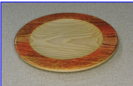
Bruce Metzdorf - Plate Dyed Pecan - Gel Poly