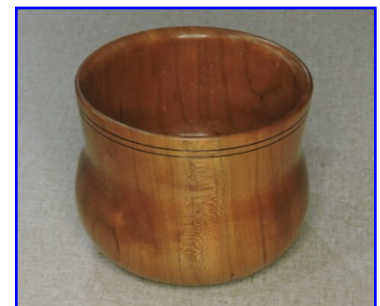
Bruce Metzdorf - Vase Cherry - Gel Poly