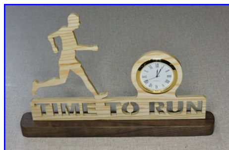
Bruce Metzdorf - Clock Ash, Walnut - Danish Oil