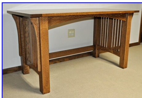
Lee Nye - Library Table White Oak - Minwax Poly