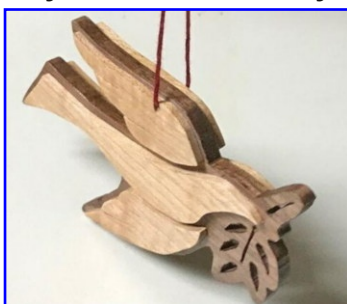
Lee Nye - Ornament Maple, Cherry - Poly