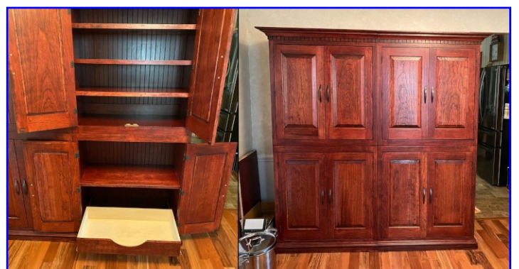
James Simnick - Pantry Cherry - Gel Stain, Poly