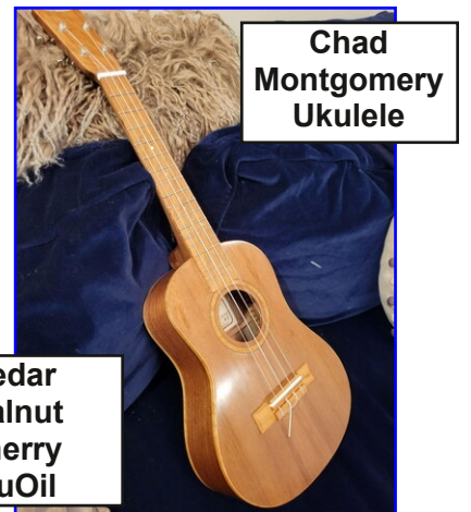
Chad Montgomery Ukulele