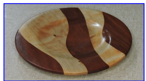
Bruce Metzdorf - Plate Bloodwood, Maple - Gel Poly