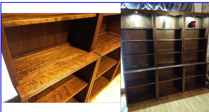
Tim McAuley - Modular Bookshelves Black Walnut - Watco