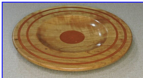
Bruce Metzdorf - Platter Cherry, Milliput - Gel Poly