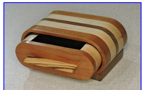
Tom Olson - Band Saw Box Walnut, Cherry - Shellac