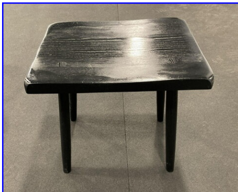
George Rodgers - Exercise Stool Ash - Spray Paint