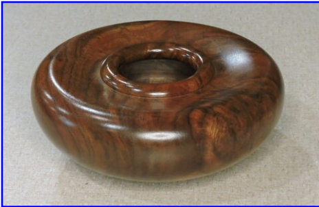
Paul Pyrcik - Hollow Vessel Walnut - Deft Lacquer