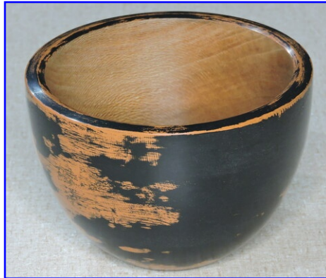
Paul Pyrcik - Open Vessel Sycamore - Milk Paint/ Oil