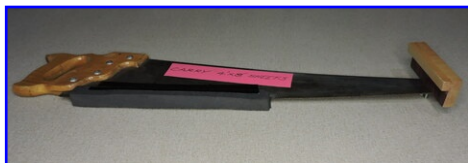
Don Carkhuff - Panel Carrier Old Rip Saw