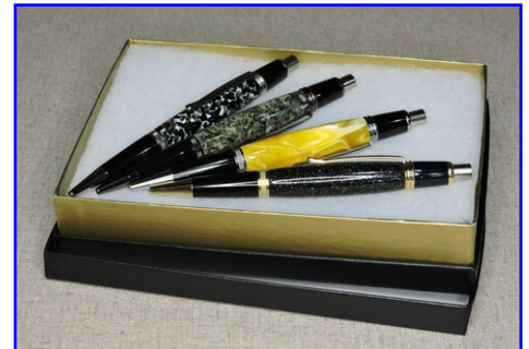
Paul Pyrcik - Four Click Pens Acrylic - Acrylic Polish