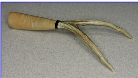
Don Carkhuff - SlingShot Tree Branch