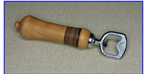
Bruce Metzdorf - Bottle Opener Cherry - Doctors Pen Finish