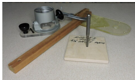
Don Carkhuff - Flexible Router Base - Scraps