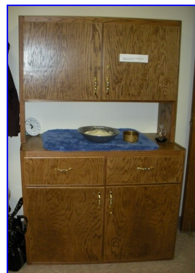
Bob Bakshis - Eucharist Cabinet Oak Plywood - Poly