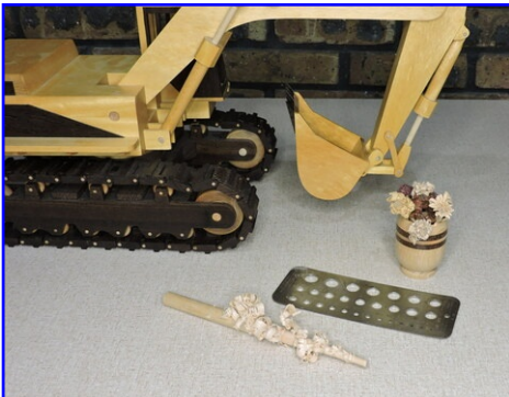
Roy Galbreath - Excavator & Flower Vase Yellowheart, Wenge, Ash, Jatoba - Spray poly