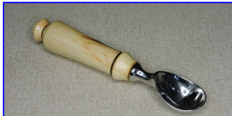
Bruce Metzdorf - Ice Cream Scoop Box Elder - Doctors Pen Finish