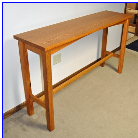
Lee Nye - Table White Oak - Deck Stain, Odies Oil