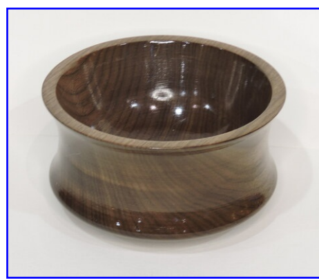
Tom Olson - Bowl Walnut - CA