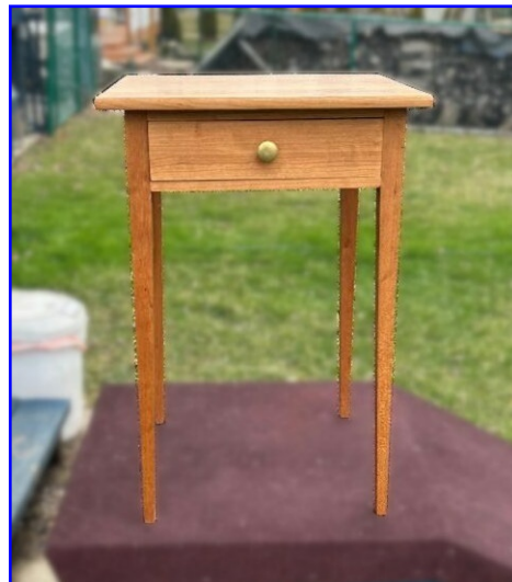
Jeff Kramer Table with Drawer Cherry Odies Oil