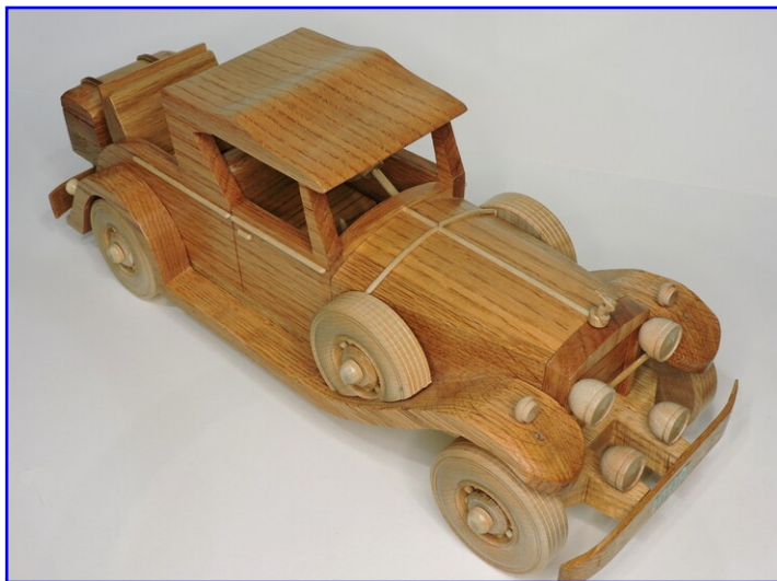
Bob Bakshis - 1931 Cadillac Oak - Poly