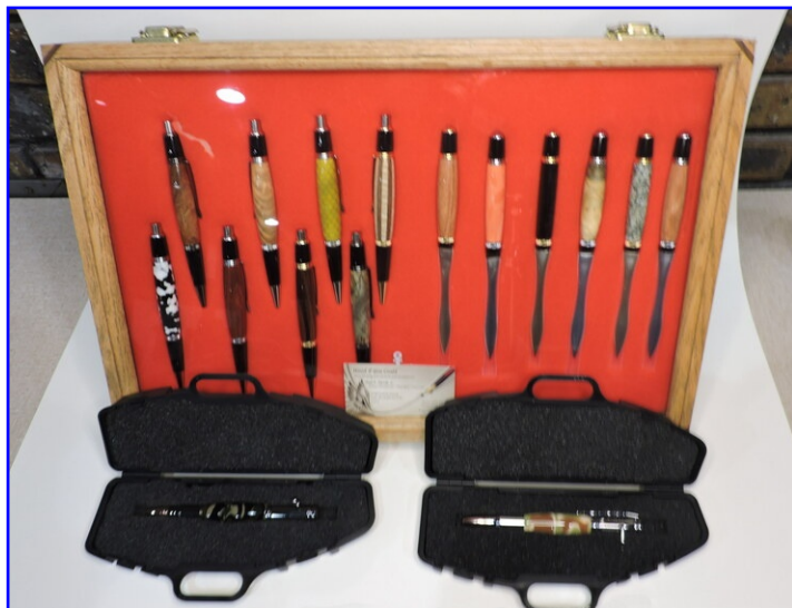
Paul Pyrcik - Pens and Openers Wood, Acrylic - CA