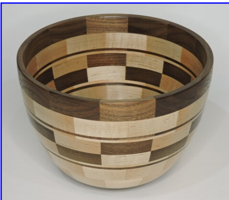
George Rodgers/Ed Buhot Segmented Bowl Maple/Walnut - Deft