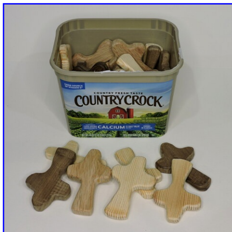
Bert LeLoup - Crosses Walnut, Pine