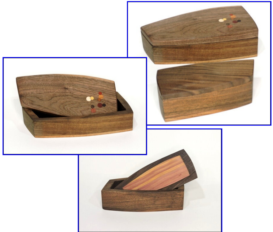
Tom Benson - Bandsaw Boxes Walnut - Tung Oil