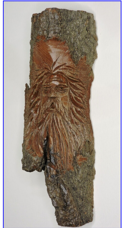
Tony Leto - Carving Cottonwood