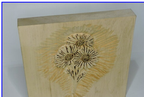
Nathan Wick - Carving Basswood