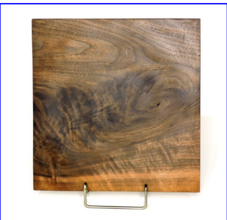
Bruce Metzdorf - Square Plate Walnut - Odies Oil