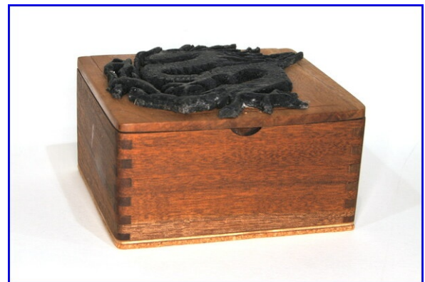
Bert LeLoup - Carved Cigar Box