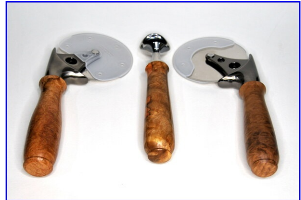
Don Burgeson - Pizza Cutters Box Burl - CA Finish