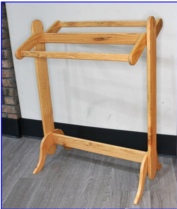
George Rodgers - Quilt Rack Rustic Oak - Waterlox