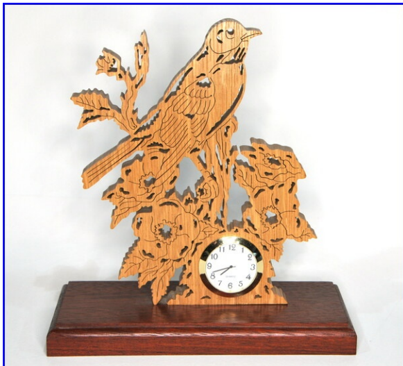
Roy Galbreath - Bird & Clock Oak, Cherry - Spray Poly