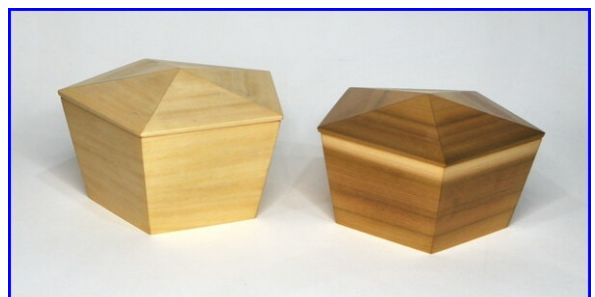
Jim Harvey - Pentagon Boxes Poplar - Watco, Wax