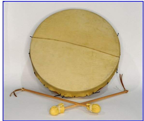
Bert LeLoup - Leather Drum Segmented Wood