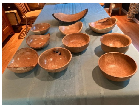
Bur Oak bowls