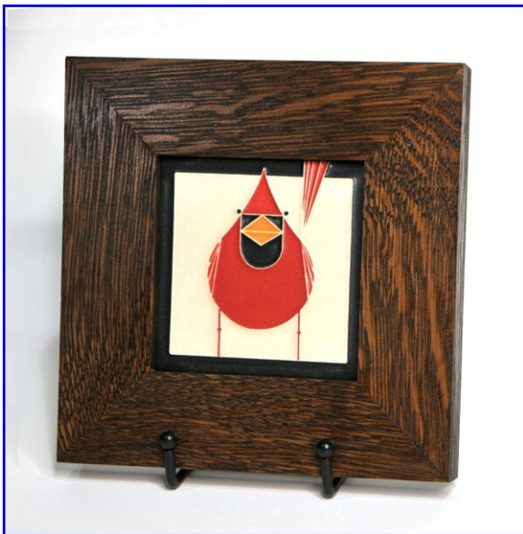
Rick Ogren - Tile Frame White Oak - Acrylic