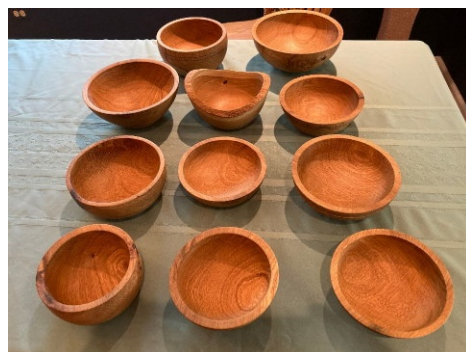
Bur Oak bowls