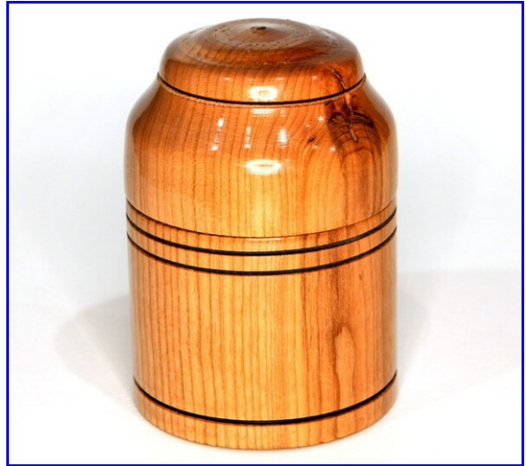
Tom Benson - Ring Box Cherry - CA Glue