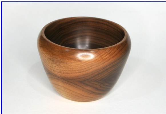
Mike Kalscheur - Bookmatched Bowl Walnut - Mineral Oil, Poly