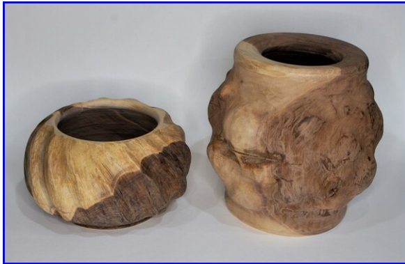
Bert LeLoup - Two Bowls Walnut - No Finish