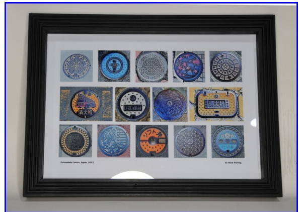
Mark Wieting - Picture Frame Pine - Paint