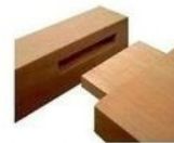
Mortise & Tenon