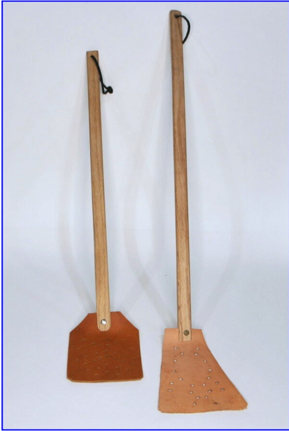
Bert LeLoup - Fly Swatters Leather - Wood