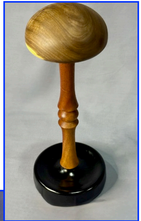
George Rodgers Wig Stand Oak, Sapele, Poplar — Polyurethane & Paint Router Jig for Inlaying Mending Plate — Plywood