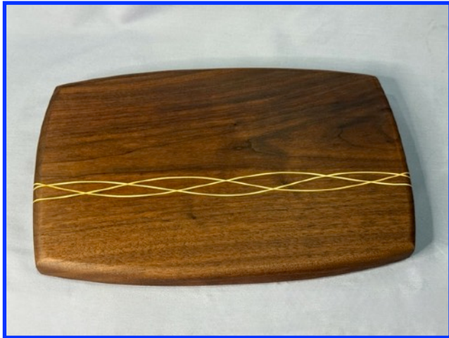
Rick Ogren — Cutting Board Walnut & Maple — Mineral Oil