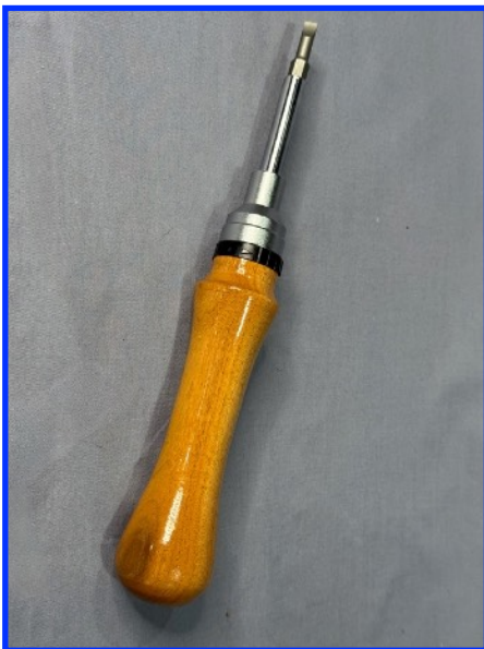
Tom Olson — Screwdriver Kit Handle Cherry — CA Glue