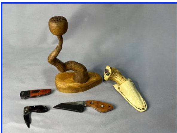
Burt LeLoup — Turned Pea Pod, 4 Knife Handles Walnut