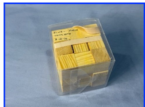
Tony Leto — Wood Puzzle Pine — None