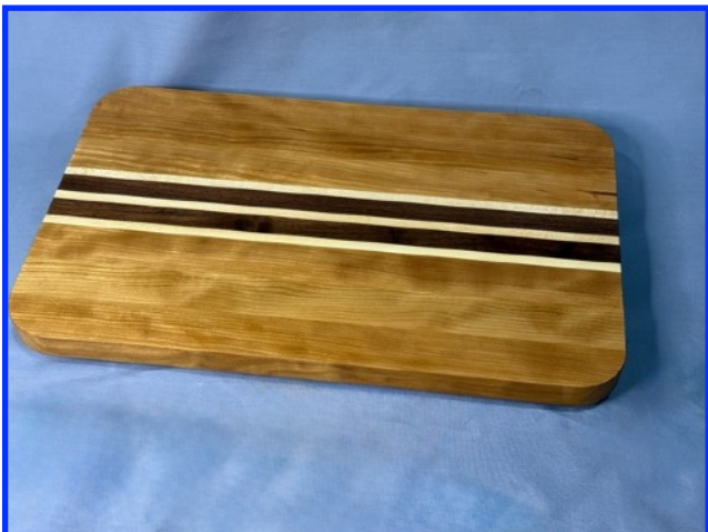
Al Cheeks — Cutting Board Cherry Maple Walnut — Walrus Oil